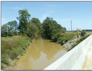
Figure 2. A project participant installs a drop pipe structure, which will allow the discharge runoff water to empty directly into Bayou DeView rather than drain across an erosion-prone field.

In 2004 TNC proposed a work plan for a series of integrated sediment, hydrology, geomorphology and biology monitoring surveys. The surveys culminated in a report and spatial relational database containing a priority ranking of the Cache River's tributary streams. Because of the short length of the study (one year), however, no flow regime or water quality trends could be established for statistical predictions.