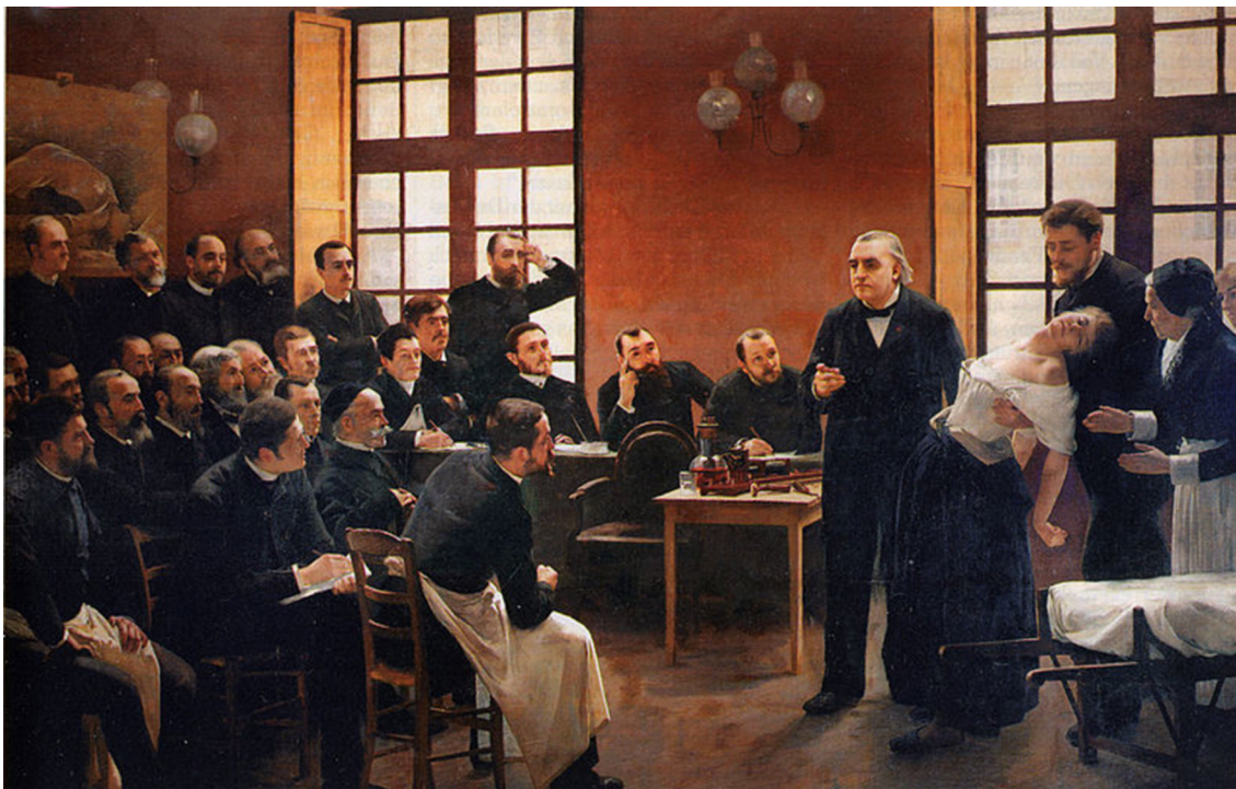
Figure 1 Une leçon Clinique à la Salpêtrière , Brouillet, 1887. Georges Gilles de la Tourette is seated in the front row wearing an apron, leaning attentively forward.

than usual in the context of the consultation room but then do become more noticeable as the appointment progresses. Occasionally a single examination cannot confirm a credible history of tics. All published descriptions use the idiom ‘wax and wane’, and most patients do describe some weeks or months as being more or less severe for no special reason. They are also generally aware of new tics appearing and old ones disappearing over time, and of having orchestrated sequences of certain tics. Some tics have a compulsive quality and merge into other obsessional symptoms. Examples are ticcing a certain number of times, ticcing until it feels ‘just right’ (eg, painfully tensing the neck,