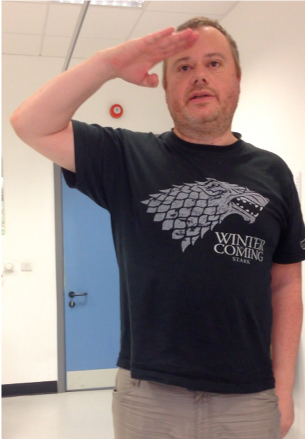
Figure 2 Still of video 1: complex motor tics.

Patients with other movement disorders do not generally describe this arc of urge–suppressibility–tic–relief. For some people, the urge is a focal feeling of the part of the body that has to move; for others it is more diffuse or not articulated in such somatic terms. Tic suppression is sometimes a physical tensing; for others it is a more psychic process that is hard to explain. For a few patients the urge and/or effort of suppression is so unpleasant that