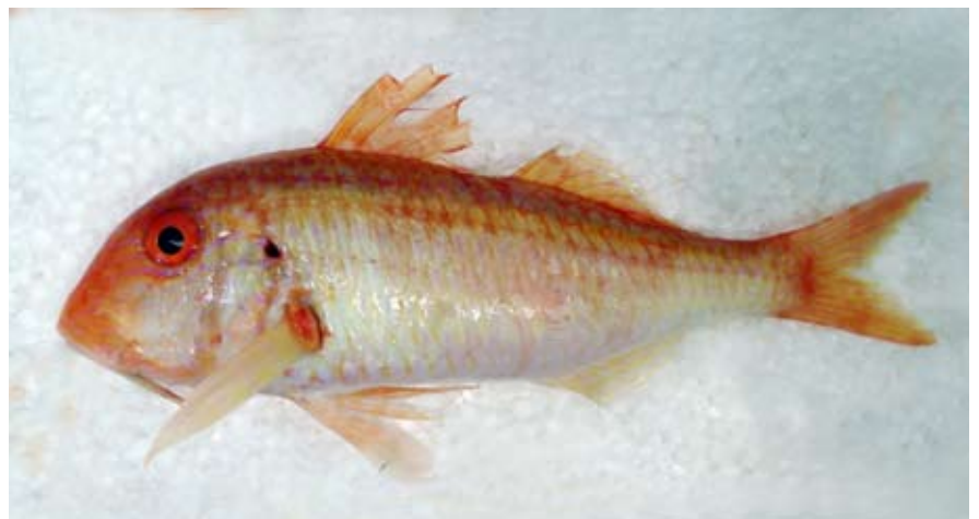
Fig. 6. Parupeneus fraserorum , SAIAB 82829, 117 mm SL, Madagascar.