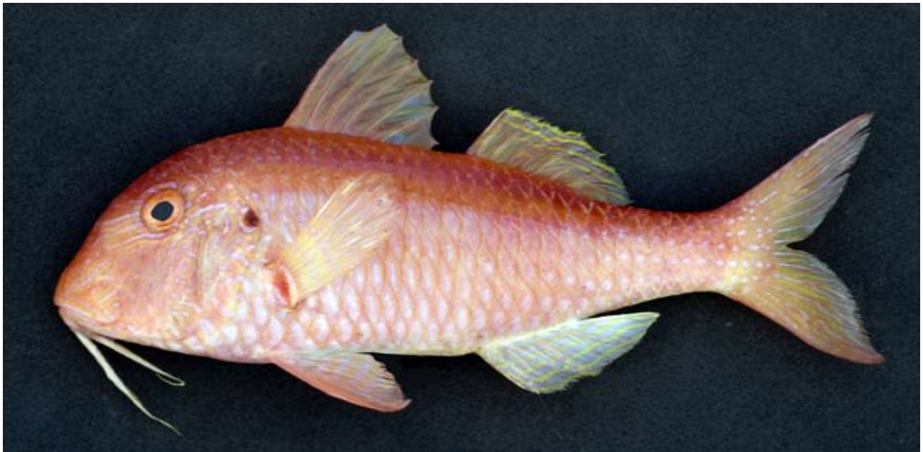
Fig. 1. Holotype of Parupeneus fraserorum , SAIAB 81385, 166.5 mm SL, KwaZulu-Natal.

parentheses refer to paratypes. The data in the table of measurements of the new species are given as percentages of the standard length. Proportional measurements in the text of the diagnosis and description are rounded to the nearest 0.05. Counts of pectoral-fin rays were made on both sides.