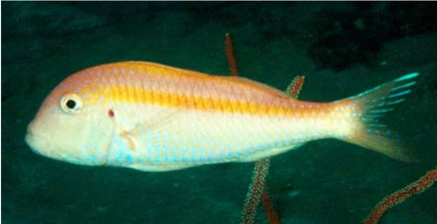
Fig. 3. Parupeneus fraserorum , KwaZulu-Natal. (Photo by Dennis R. King).