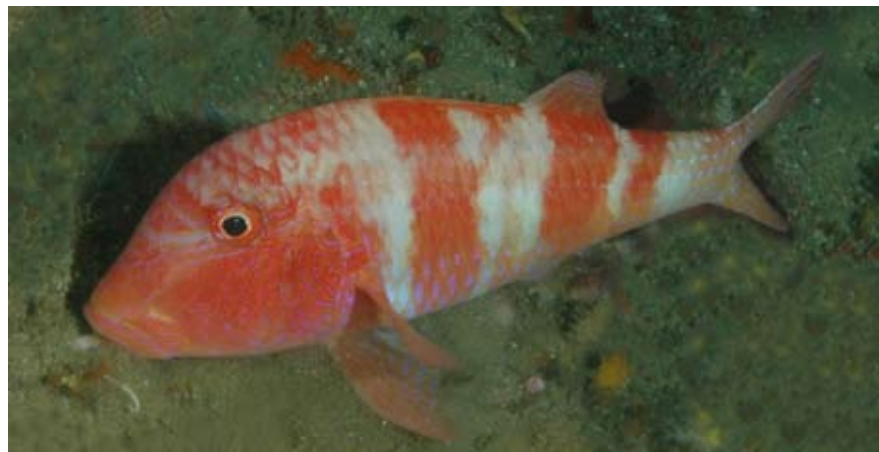
Fig. 5. Parupeneus fraserorum actively feeding, KwaZulu-Natal.