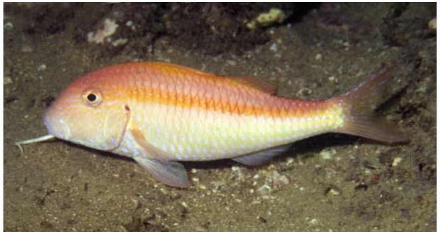
Fig. 4. Parupeneus fraserorum , KwaZulu-Natal.