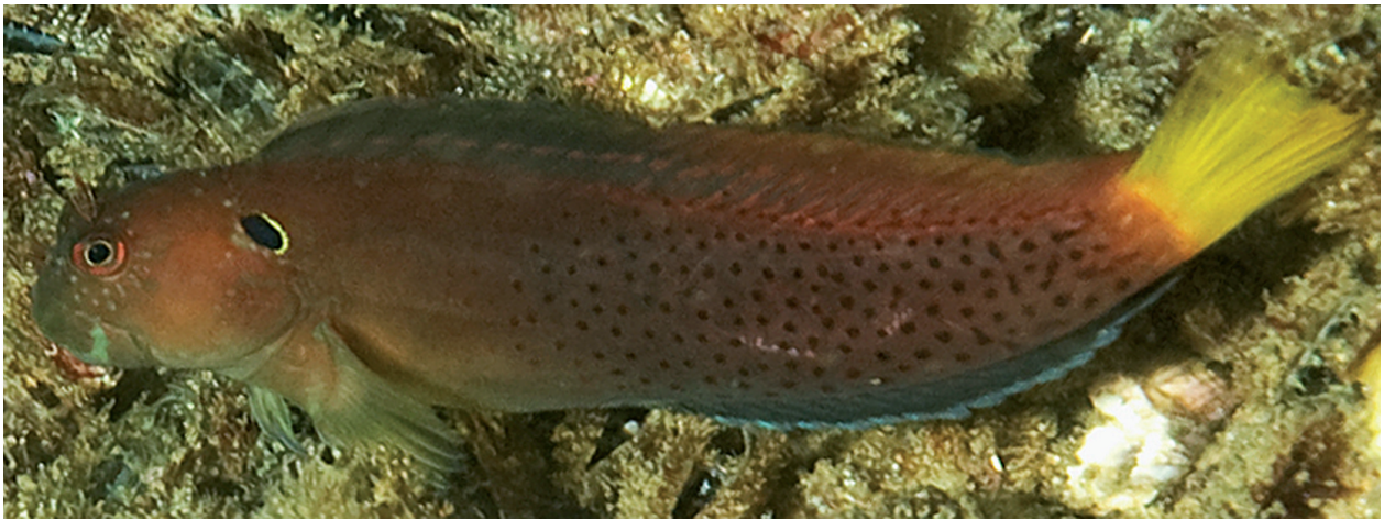
Fig. 1. Underwater photo of a female Cirripectes heemstraorum photographed by Dennis King on the DAR-1 artificial reef, iSimangaliso Wetland Park, Cape Vidal, South Africa.

Specimens are deposited in the South African Institute of Aquatic Biodiversity (SAIAB) and the Division of Fishes, National Museum of Natural History, Smithsonian Institution (USNM).