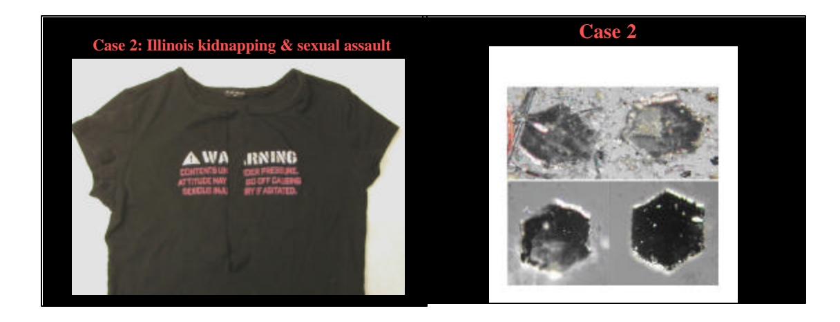
Left, cut through glitter design area of T-shirt. Right (top) glitter particle from victim's shirt and glitter particle recovered from clothing of suspect viewed as tape lifts and on separate stages of a comparison microscope. Right (bottom) same two particles after they have been picked off the tape and cleaned up.