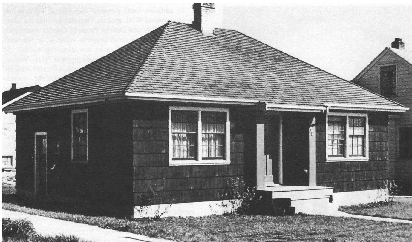
FIGURE 3. House type H-21 in Vancouver.

While municipalities regarded wartime and post-war housing conditions as a national problem requiring a federal government solution, WHL encountered many local obstacles to the implementation of its programs. By May 1945, Pigott reported to WHL shareholders that, on the whole, smooth municipal relations had replaced earlier "very troublesome" 77 dealings. In fact, many municipal governments reserved "hostility," or at best "passive tolerance," for WHL projects. 78 Often, they simply resented the intrusion of a large-scale federal project into a local community. For example, general public antagonism greeted a WHL scheme for New Glasgow, Nova Scotia. 79 Complaints about a hous-