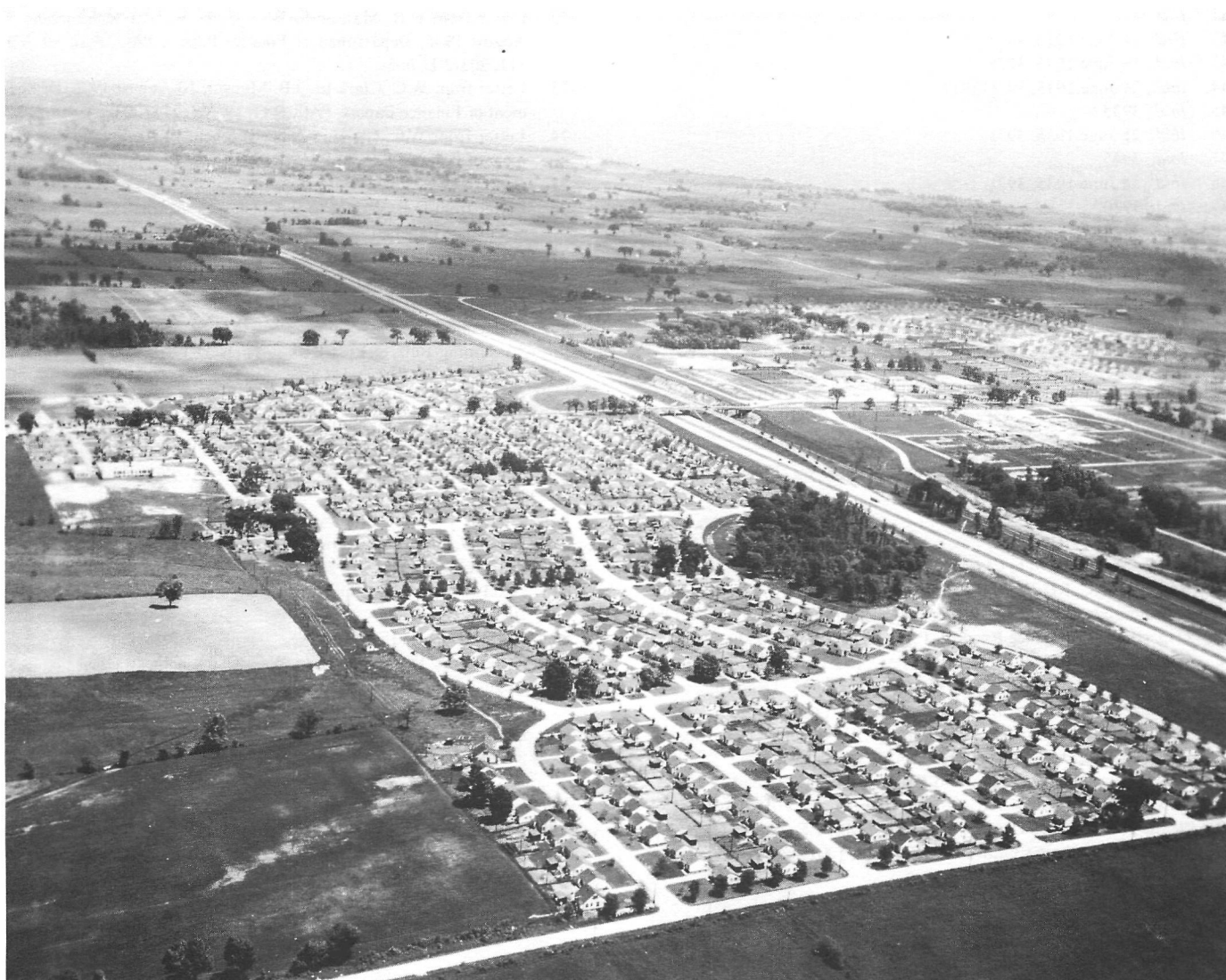
FIGURE 1. Ajax, Ontario, 1951. Most of the housing shown here was built during World War II by Wartime Housing Limited.