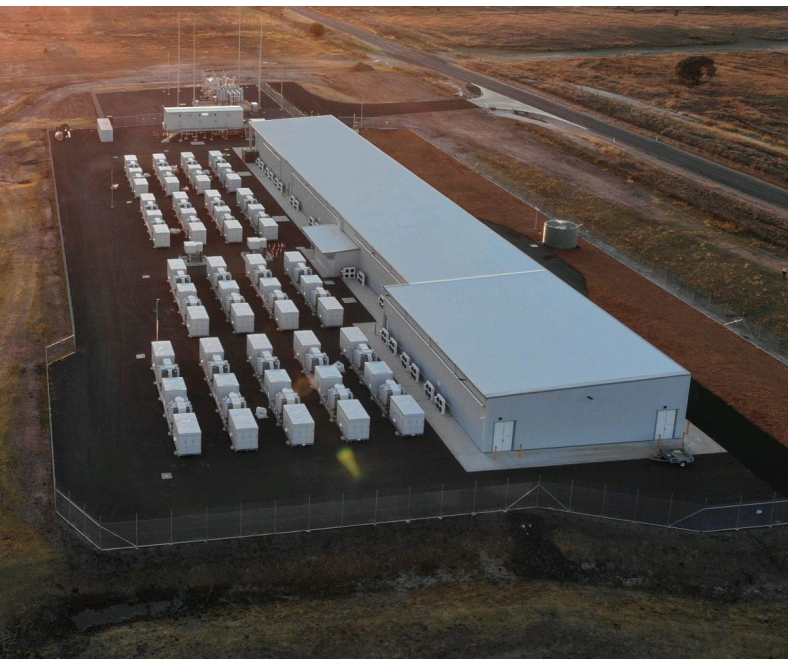
Wandoan South Battery Energy Storage System