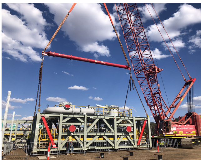
Origin Talinga Orana Gas Gathering Station Project