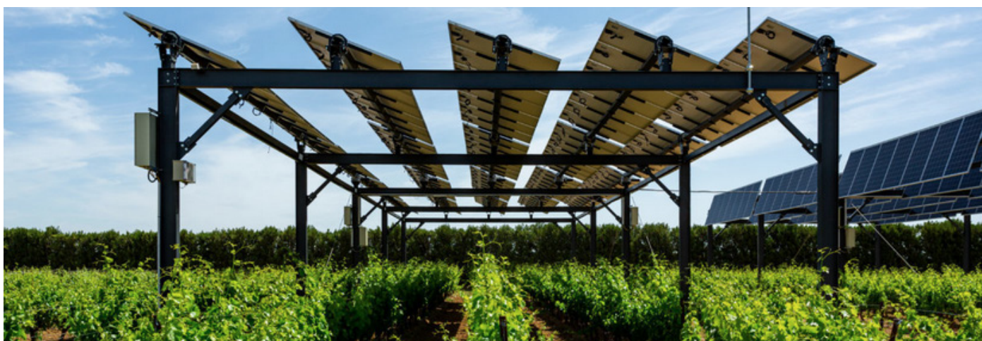
Daystar Energy - 100mw Agrivoltaic Solar Farm