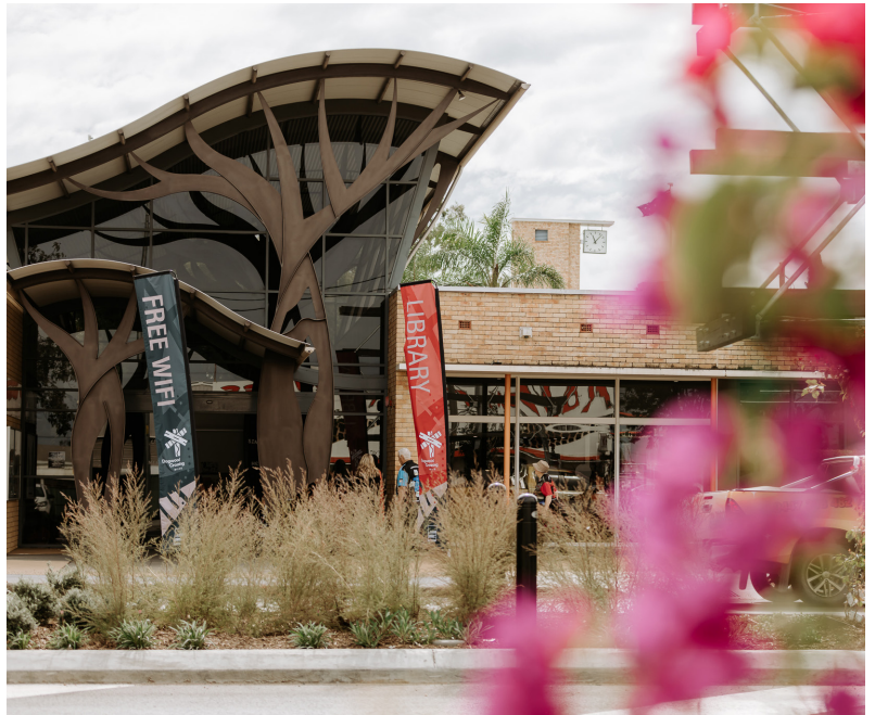
Miles CBD streetscape