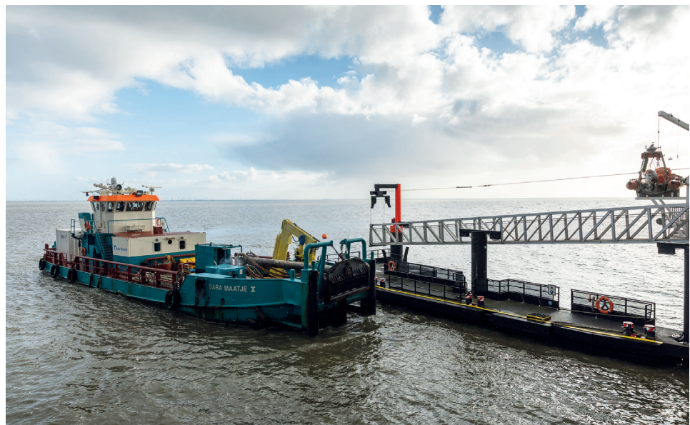
A supply vessel docking at Mittelplate.

Domestic production also offers other advantages: every cubic metre of natural gas and every tonne of crude oil produced in Germany does not have to be imported. Shorter transport routes and thus lower greenhouse gas emissions make an additional important contribution to climate protection.