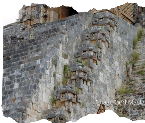
Chaac God Masks

This archaeological zone has 15 groups of buildings, distributed from north to south, in an extension of approximately 2 km.