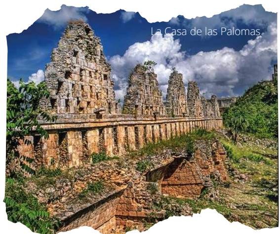
La Casa de las Palomas

During your visit to Uxmal, at night you can enjoy the sound and light show from the Cuadrángulo de las Monjas, which narrates the Maya legends and customs and is translated into 4 languages