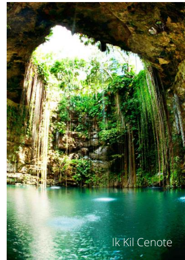
Ik Kil Cenote