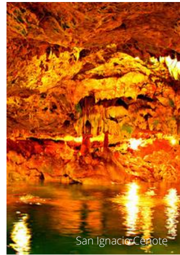
San Ignacio Cenote