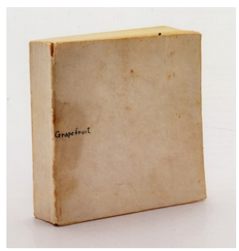
Figure 2. The first print of Yoko Ono's book of instructional paintings, Grapefruit, from 1964.

It was important for Ono that people not think of the instruction paintings as "calligraphic art"—that is, art which used words as an aesthetic element or object.<sup>32</sup> Ono wanted the work to be thought of as instructions, retaining the tripartite structure of being simultaneously a concept, an object, and a work to be realized. At her first show with instruction paintings, in 1961 at the AG Gallery in New York City, people ignored the conceptual element of her pieces and regarded it as "just a calligraphy show"<sup>33</sup> since she had displayed her instructions in her own writing. Ono recalled that only one obscure newspaper even mentioned it as an instruction painting show.<sup>34</sup> After that, Ono elected to "print out the instructions instead of using my own handwriting, to make a point that they were instructions, not words drawn by the artist as visual images."<sup>35</sup>