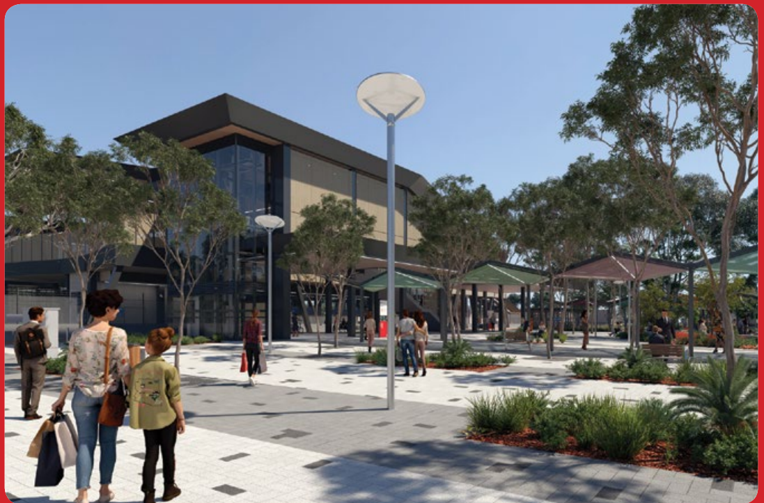
Artist impression of Malaga Station.

Designed to be a 'station within a park', the design draws on the surrounding parklands and banksia bushlands. As the first significant building in the future Malaga town centre, the architecture and scale considers the future opportunities for the Malaga Station Precinct.