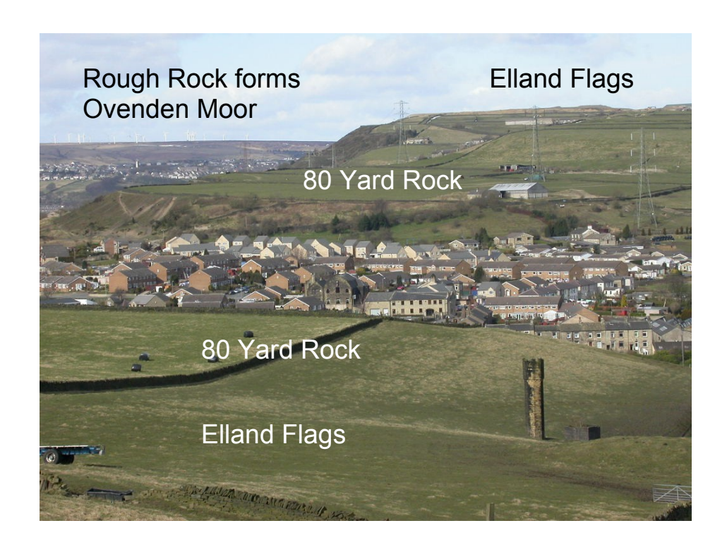
View to north from Beacon Hill