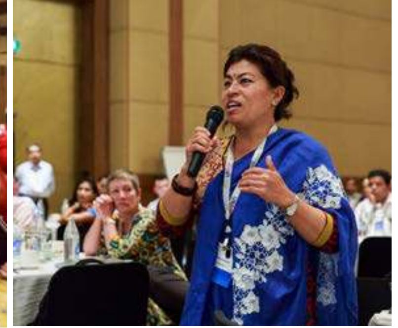
The 2018 TOPS/FSN Network Asia Regional Knowledge Sharing Meeting in Bangkok, Thailand brought together food security experts for knowledge sharing, skills building, and networking.