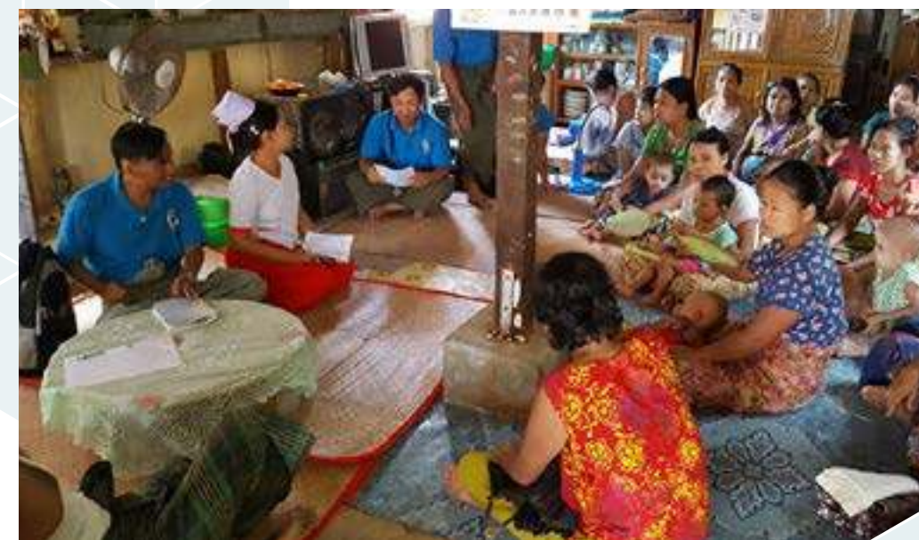
A medical officer leads a maternal and child health care training at a primary health care center in Myanmar.

To respond to organizational and individual member needs, CORE Group carried out a revamp of its member benefits and a restructure of membership categories, which will be launched in 2019. CORE Group also undertook a feasibility study to include International Organizations officially in its membership to elevate their work at the country-level in the International Health Community Network. Findings and recommendations of this study will guide the trajectory of membership recruitment 2019 onwards.