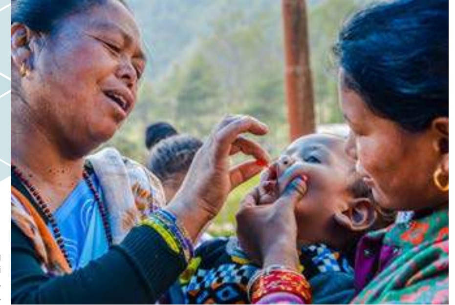
FCHV support to feeding vitamin A during national vitamin A campaign at Jiri Municipality, Dolakha district, Nepal.