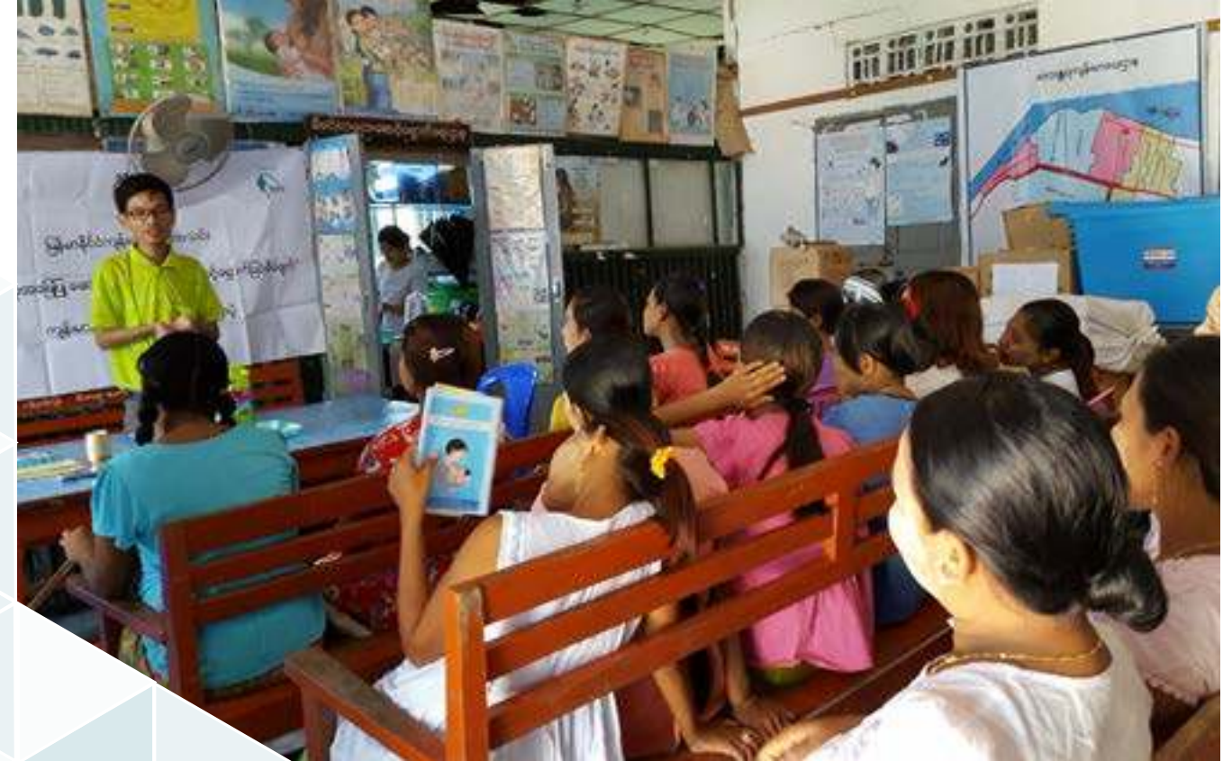
Maternal and child health care education sharing by medical officer at primary health care center.