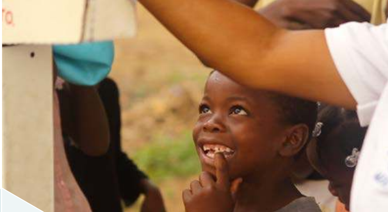
A young boy from a batey (shanty village) in the San Pedro district of the Dominican Republic is weighed by the staff of a mobile clinic sponsored by Medicines for Humanity.