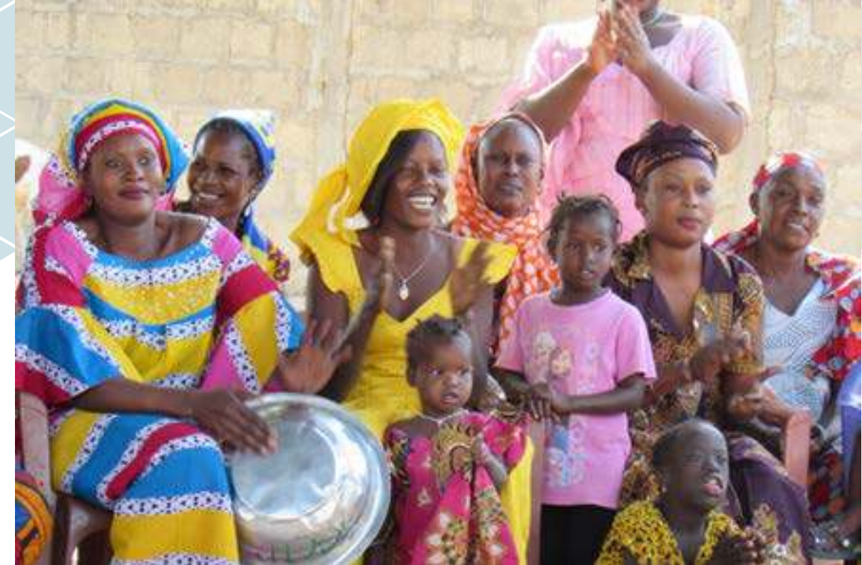
Mothers and children singing, Sam Ndiaye, Senegal.

CORE Group supported the coordination of several panels hosted by USAID's flagship Maternal and Child Survival Program (MCSP) and CORE Group Polio Project (CGPP) examining the role of SBCC in polio eradication worldwide. In "Necessary Bedfellows - But How to Connect? Data and SBCC", experts discussed the inter-relationship between data and SBCC through the lessons learned from the polio experience in India, Nigeria, and Pakistan and from a global perspective. In "Polio Communication: What Works in Complex Settings?", experts examined how learnings from polio eradication may be applied to work in other development issues in equally complex settings with low performance against the Sustainable Development Goals.