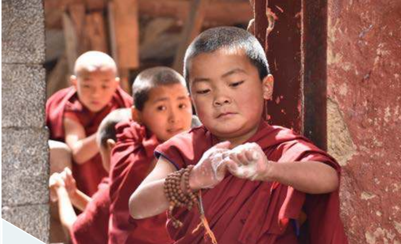
Children from Gumba wash hands before their meal. Thupting Chhyoling Monastery, Solududhkunda Municipality Ward No. 2 Junbesi, Solukhumbu, Nepal, during the campaign of Good Nutrition Program 2018.