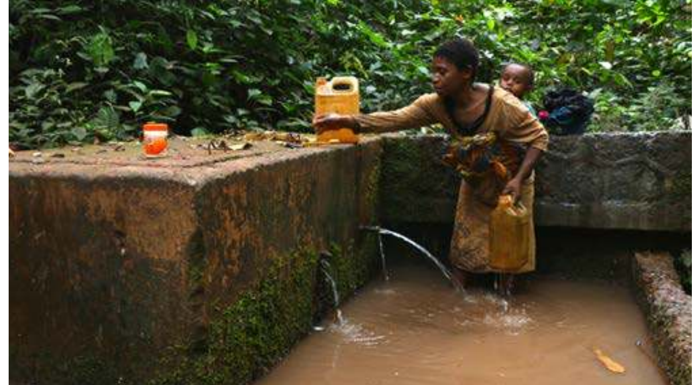
With her baby, a mother collects water at a newly dug borehole funded by Medicines for Humanity in North West Cameroon.

In 2018, these Technical Working Groups and Interest Groups hosted 17 KNOWLEDGE SHARING EVENTS on a variety of topics reaching over 1,500 PARTICIPANTS GLOBALLY .