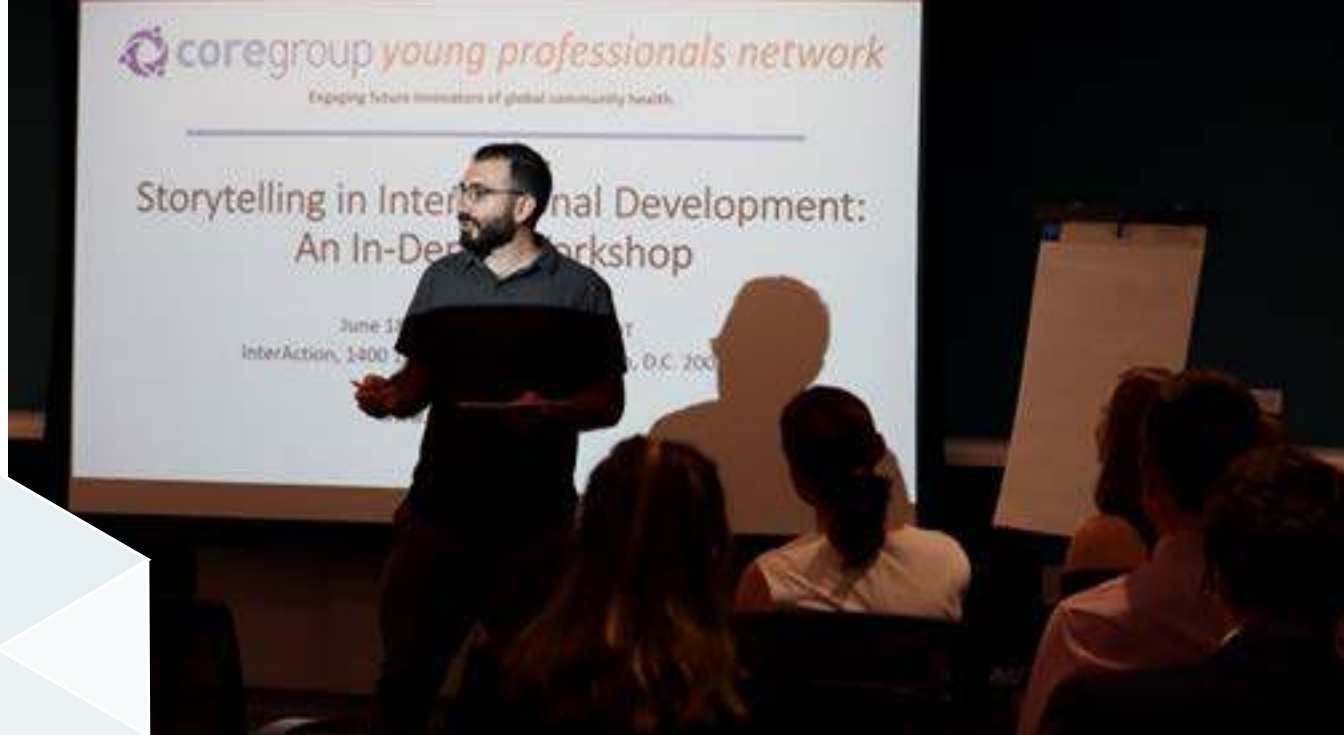
CORE Group's Young Professionals Network invites subject matter experts in development to co-host career development workshops. Digital Development Communications was one such partner designing a workshop about the use of video storytelling in development programming.