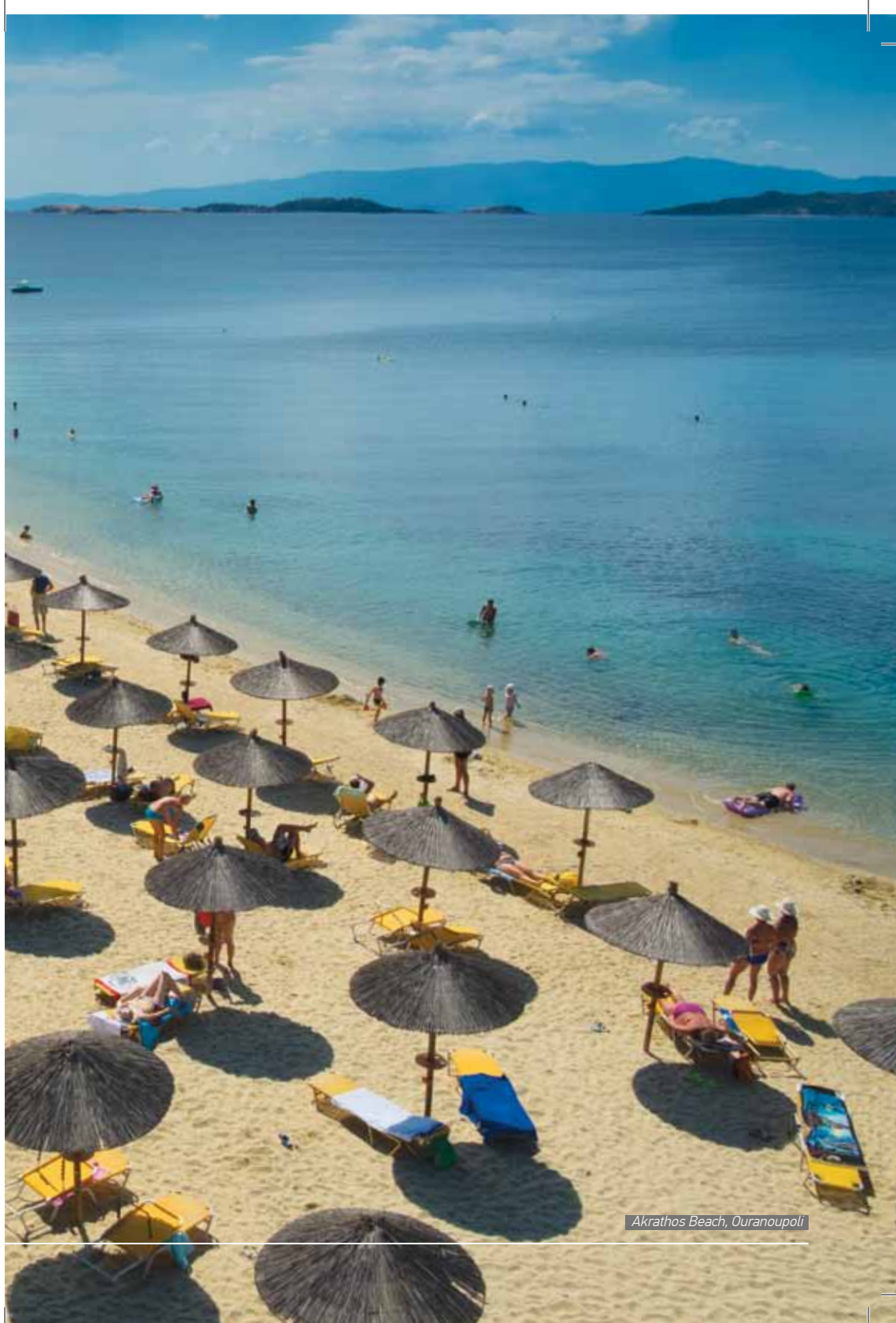
Akrathos Beach, Ouranoupoli