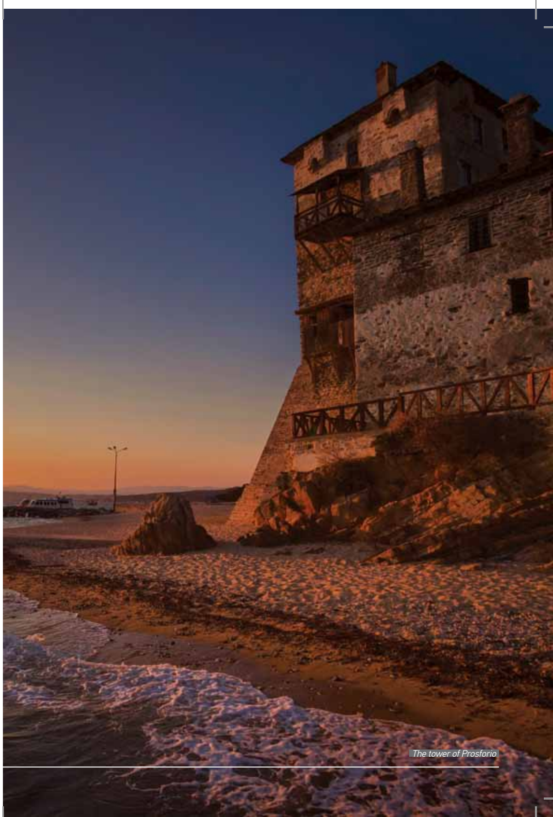
The tower of Prosforio