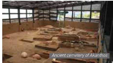
Ancient cemetery of Akanthos

the church of St. Nicholas, has been highlighted a small portion of the cemetery is open to the public. The graves are located in three successive levels, dating from the Archaic to the Hellenistic period and belong to all periods of ancient times. The burial gifts, which accompanied the deceased in the afterlife, were usually clay pots, figurines, coins and jewelry. The location of the grave goods were not always the same and the amount or wealth is not correlated with the type of the tomb, but the real or desired social status of the deceased.