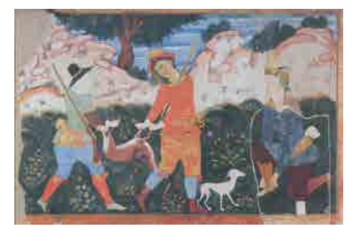
Fig. 68 Anonymous master, Hunting Scene , ca. 1650, wall painting in the Chihil Sutun palace, Isfahan

Study of this material, and of our subject in general, has greatly benefited from the work of Amy Landau. One of her most striking conclusions is that the application of Western principles of art in Persia was not a long-term trend in taste or a natural outcome of increased East-West commerce. Rather, its most significant manifestation took place all at once, at a