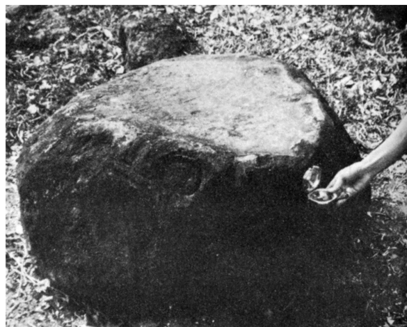
FIGURE 2. Stone turtle head found in Izapa and compass needle pointing to the snout (Reproduced from Nature 259 (1976) 390).