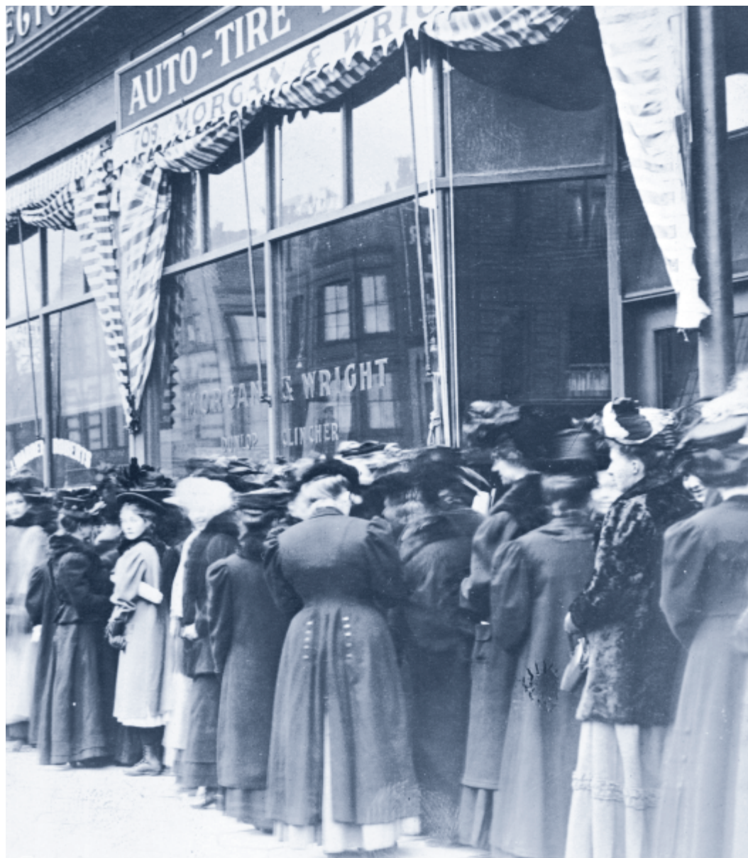
Minneapolis women lined up to vote for the first time.

The photo on p. 294, by Harris & Ewing of Washington, D.C., is from Women of Protest: Photographs from the Records of the National Woman's Party, manuscript division, Library of Congress, Washington, D.C. All other illustrations are in MHS collections.