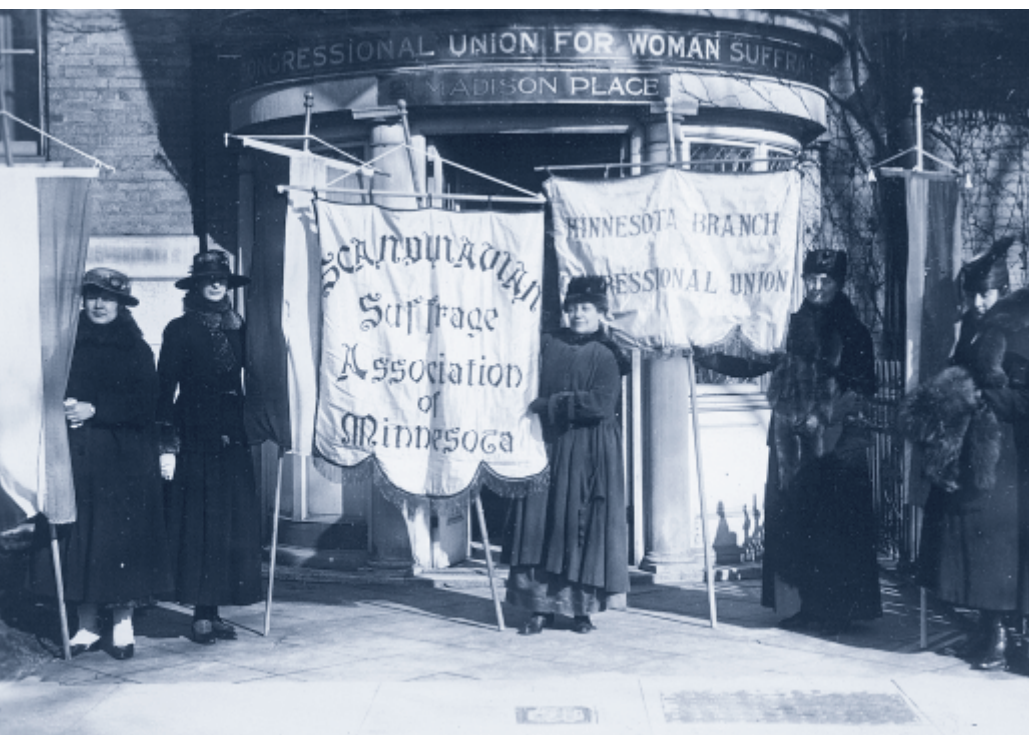
Preparing to picket the White House, Minnesota Day, 1917

A photograph of the Scandinavian section shows women dressed in traditional costumes marching along, holding the Norwegian, Swedish, and Danish flags and an English-language sign demanding the vote. Besides demonstrating the suffrag-