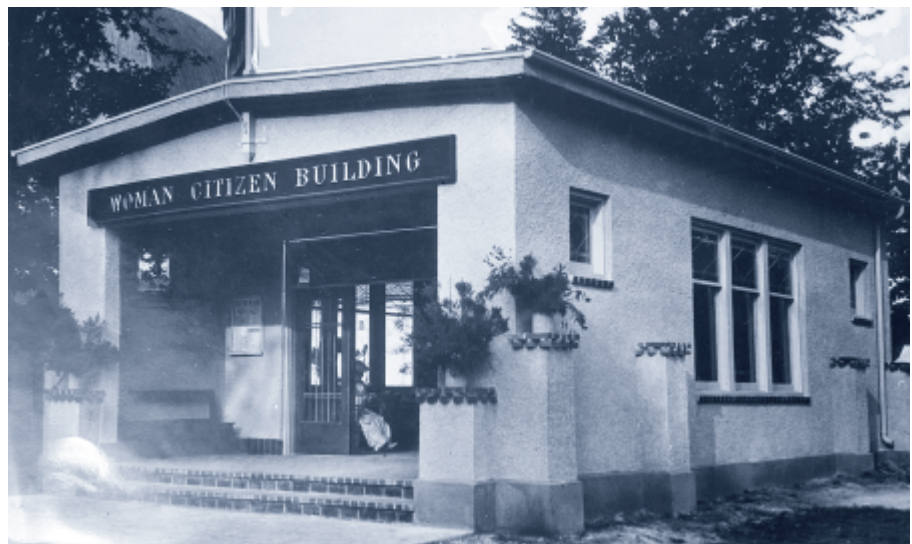
Woman Citizen Building, Minnesota State Fair, 1917

The new structure was called the Woman Citizen Building in hopes that women would use it long after the vote was won. It served as a gathering place—both an information hub, educating the public on why women should vote, and a place for all women to socialize, rest, and relax in front of a central fireplace built with a bequest from the will of Julia B. Nelson. 32 While the SWSA probably targeted Scandinavian Americans during the