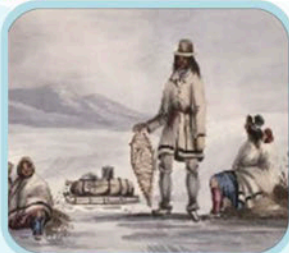
Asua's'g Travel Nokekkoman

Hover over the images to find out some interesting facts about each object.