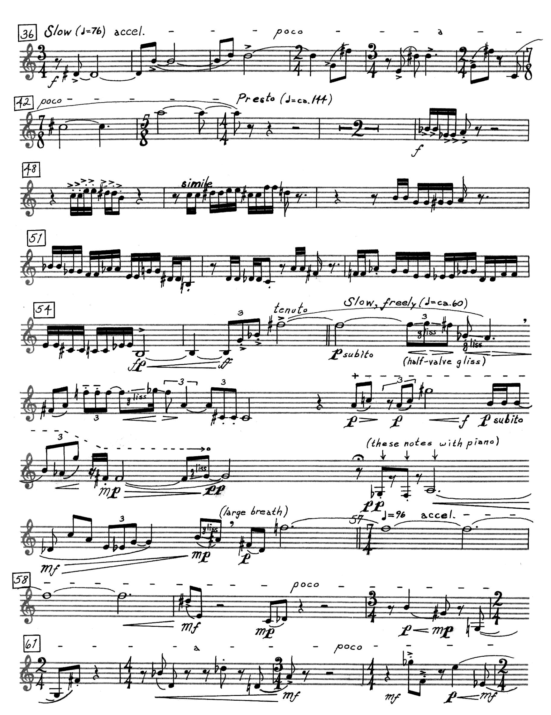
Horn in F