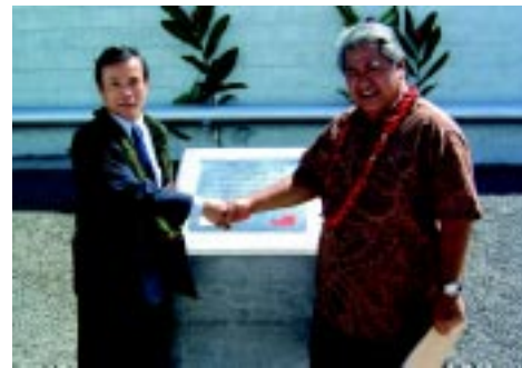
Ambassador Masaki Saito and Prime Minister Tuilaepa Aiono Sailele Malielegaoi shake hands by the commemorative plaque.

The development of port facilities is one of the most important issues in the Government of Samoa's national development plan. The main objective of this project was the