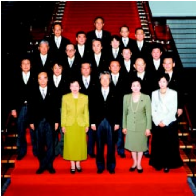
Prime Minister Koizumi's Cabinet

Contacts: House of Representatives: www.shugiin.go.jp/index.nsf/html/index_e.htm Foreign Press Centre: www.fpcj.jp