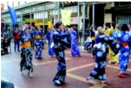
Upper Hutt College Students perform the Bon Odori Dance in Cuba Mall, Wellington on Sunday, August 10.