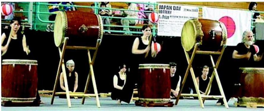
Taiko drum group, "Waikaito", giving a rousing performance at Japan Day in Auckland.

and participants throughout the day. Other attractions included food stalls, selling traditional Japanese festival-style snacks, mochitsuki (rice-cake making), and an Ikebana display.