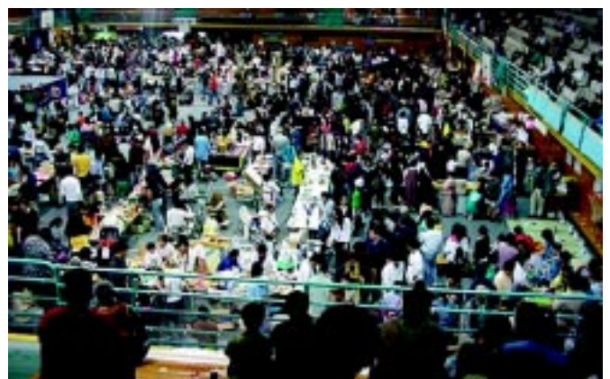
The crowd at Japan Day fills the ASB Stadium floor to capacity.

As in previous years, an origami workshop proved to be very popular with children, attracting a sizeable crowd of onlookers