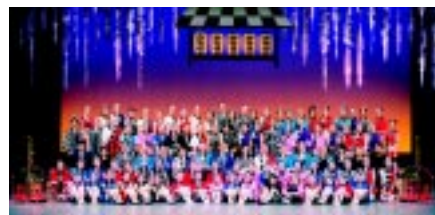
The Canterbury Ballet Company and One Day Kurashiki Ballet Company at the Gebukan Theatre, Kurashiki, 18 October 2003.

"16 October: The company went to the Gebukan Theatre for warm-up class, tech rehearsal and finale rehearsal with the Japanese dancers. We were faced with a theatre that was unimaginable. With over 20 tech advisors and hundreds of lights which shone from all possible angles, the company truly felt inspired. Rehearsals finished and the dancers were introduced to The One Day Kurashiki Ballet Company. These 75 dancers ranged from 9-26 years old and did everything they could to make us feel at home."