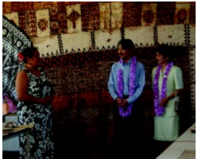
Prince and Princess Akishino visit the National University of Samoa (Home Economics Department)

The Government of Samoa hosted a reception for the royal couple at the Robert Louis Stevenson Museum. In his speech Prince Akishino thanked the Government for the invitation to visit Samoa and said, "We have seen just a few of the many examples of the broad range of cooperation which already exists between Japan and Samoa. I am pleased to note that these have contributed to our friendship and to the growing prosperity and well-being of the people of Samoa." He added, "I have also been impressed by the efforts of the people of Samoa to develop their homeland in harmony with their traditions."