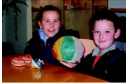
Pupils from Masterton International School at the JICC, Tuesday, 12 August, learn about toys in Japan

More classes will be held throughout the year. Please check the "What's New" pages on the Embassy's website, www.nz.emb-japan.go.jp , for details.