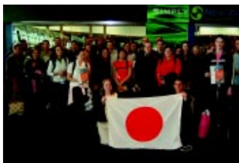
New JETS at Wellington airport on Saturday, July 26.

Information about the JET programme is on the Embassy website, www.nz.emb-japan.go.jp/cultural/JET.html