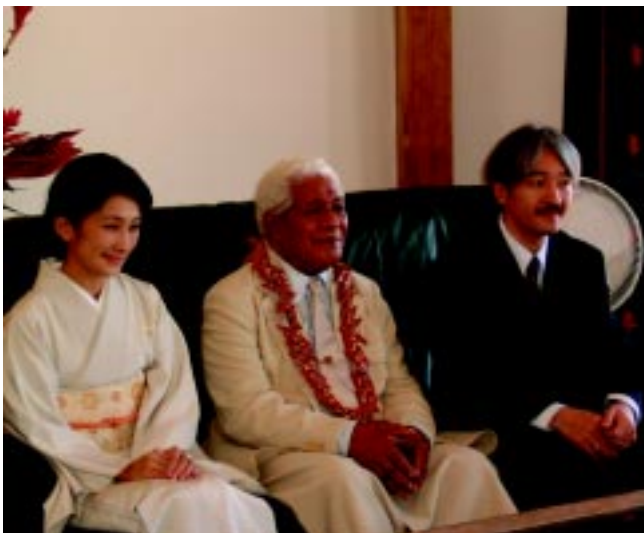
Their Imperial Highnesses with the Samoa Head of State

Prince Akishino is the second son of Their Imperial Highnesses Emperor Akihito and Empress Michiko. The royal couple have two daughters, Princess Mako (13 years) and Princess Kako (9 years).