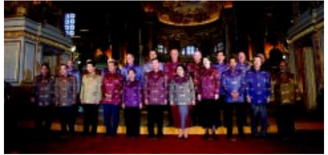
APEC Leaders at the Ananta Samakhorn Throne Hall, Bangkok, Thailand on 21 Oct 2003

Website: www.mofa.go.jp/policy/economy/apec/2002/activity.html