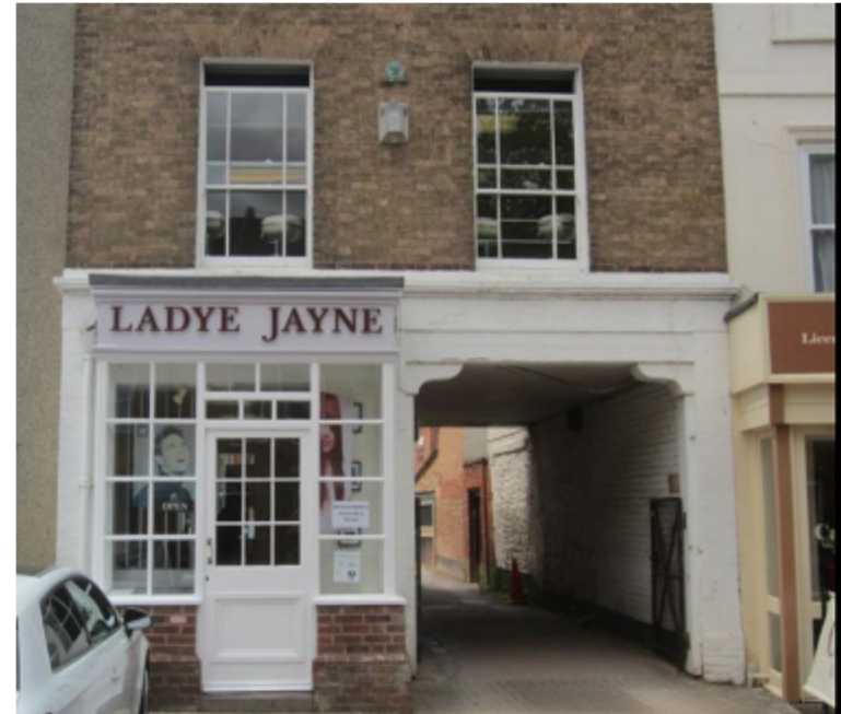
Entrance to former court off High St.