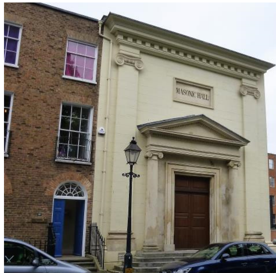
Masonic Hall, the Crescent