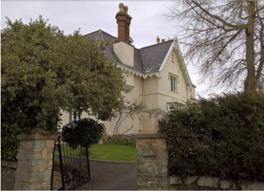
17 Haines Hill

Soon after the First World War broke out Trenchard was appointed General Officer Commanding, the Royal Flying Corps, and on 1 April 1918 he reluctantly became Chief of the Air Staff for the newly-created RAF, the world's first independent air force. In the ten years from 1919 he resisted every attempt to deprive the RAF of its independence and thus ensured that Britain was far better prepared when war again broke out in 1939. He always denied that he deserved to be called Father of the Royal Air Force, but almost everyone else recognised that the name expressed a simple truth.