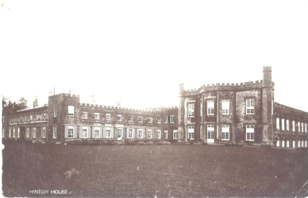
Hinton House, c.1914

During the First World War Hinton House in Hinton St George took on a new role as a Red Cross War Hospital. It was part of a network of Auxiliary Home Hospitals, which supported the military hospitals that were run by the Royal Army Medical Corps. Over 3,000 beds were made available in auxiliary hospitals across the country during the war years. The patients who were cared for at Hinton House Hospital did not generally have life-threatening injuries, but needed time to convalesce from their wounds or illnesses. The beautiful country house location provided the ideal setting, a world away from their recent experiences of the battlefield.