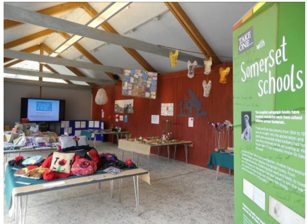
Pupils' work on display at the Somerset Rural Life Museum