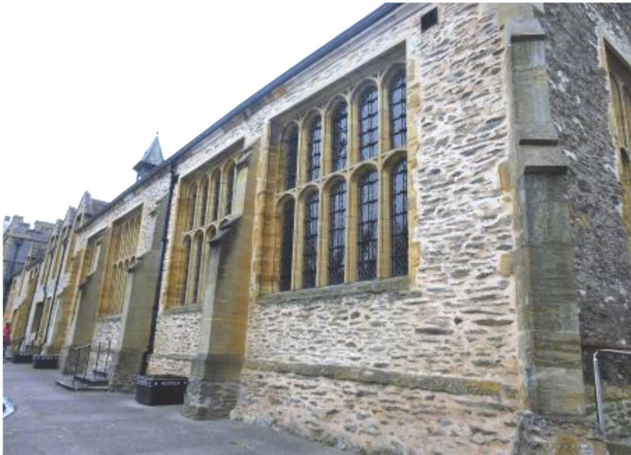
The old Grammar School

The creation of two schools for boys and girls by Huish's charity in the 1870s ushered in a new era in secondary education for Taunton and eventually led to two important and long-lived grammar schools; Huish's School for Boys, later transformed into a mixed sixth form college, and Bishop Fox's School for Girls, now a mixed comprehensive school. Perhaps it is fitting that after many changes of site and buildings both adjoin each other on the south-west side of Taunton.