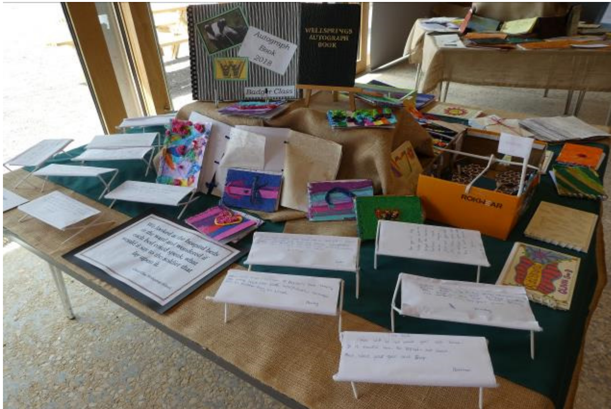
School children's work, including model hospital beds, made as part of the Take One Project and inspired by Hinton House War Hospital autograph book.