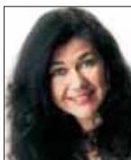
Åserud, Lise Scanpix Photographer