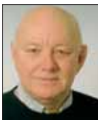
Lystad, Lars TV Commentator - Athletics