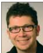
Graff, Espen TV Host/Reporter