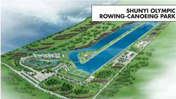
SHUNYI OLYMPIC ROWING-CANOEING PARK

Venue: Kayak – Location from Olympic Village: 36 km – ≤ 30 min – Floor area: 31,850 sq m – Permanent seats: 1,200 – Temporary seats: 25,800 (10,000 for standing seats).