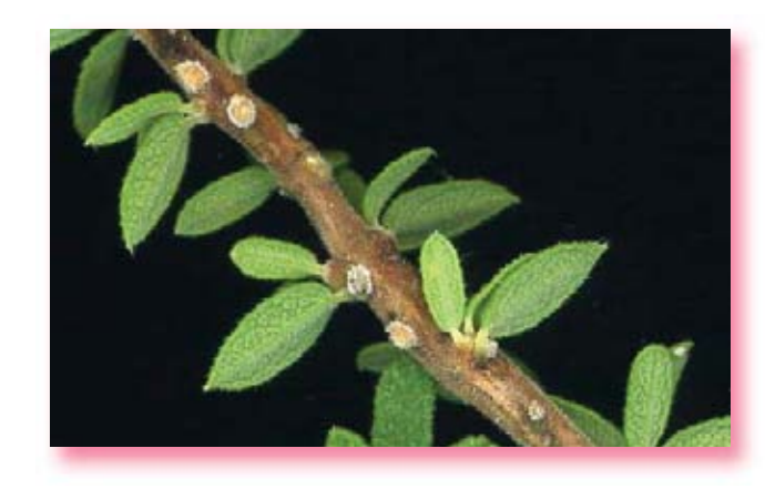
Scale on the underside of branch is infected with Asterolecanium (pit scale).

This is a tropical plant with excellent potential as a shohin bonsai. The trunk of Nashia inaguensis acquires an almost fluted, old look very quickly. Rootage at ground level is consistently abundant and adds to the aged appearance. It does not develop a trunk very