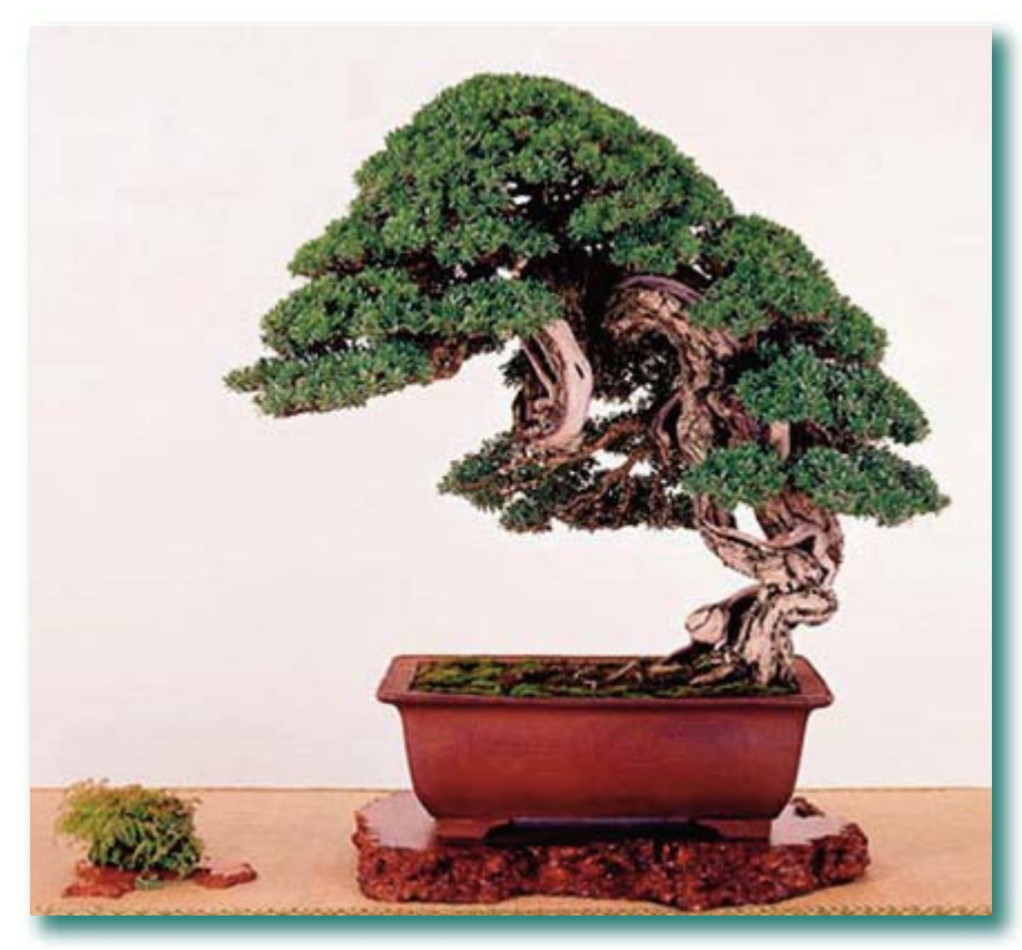
Pemphis acidula bonsai created by the author.

So, Pemphis acidula is able to withstand cold winter (at least in the subtropics) if proper cultivation is provided.