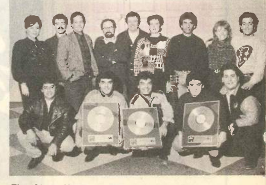
The Gipsy Kings at Toronto's Diamond with reps from Music Brokers and Trans Canada.

It has been pointed out, however, that national distribution is not required at the time of application in order to be recommended for funding under the FACTOR loan program, but, a project that is recommended may receive an offer of funding that is conditional upon securing national distribution for the completed product.