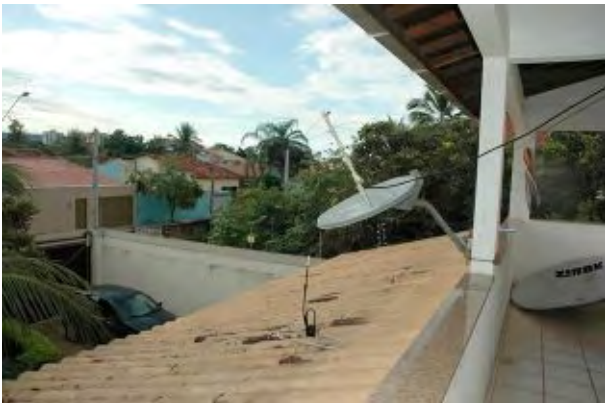
Brazilian satellite hackers use high-performance antennas and homebrew gear to turn U.S. Navy satellites into their personal CB radios.

CAMPINAS, Brazil — On the night of March 8, cruising 22,000 miles above the Earth, U.S. Navy communications satellite FLTSAT-8 suddenly erupted with illicit activity. Jubilant voices and anthems crowded the channel on a junkyard's worth of homemade gear from across vast and silent stretches of the Amazon: Ronaldo, a Brazilian soccer idol, had just scored his first goal with the Corinthians.