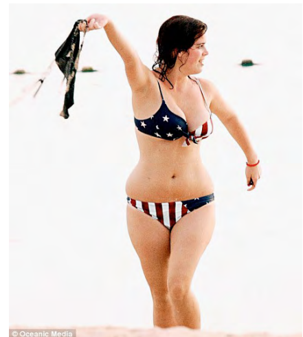
Princess Eugenie

http://www.dailymail.co.uk/news/article-1171625/Just-paying-Princess-Eugenies-100-000-gap-year-security-bill.html