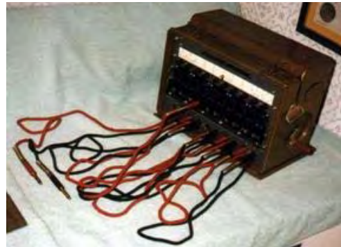
SWITCHBOARD OF THE PERIOD

At about this time, (1914 and immediately prior to then,) the field switchboard had been developed. A switchboard, in its simplest form, is a distribution box whereby incoming calls from outlying telephones can be directed to various other telephones. In the time frame which we are currently examining this would have been by means of the old plug into socket operation, and the switching keys so familiar to those of us of "advanced years!" Most switchboards would be in fixed installations such as trench protected command posts, or CPs. The German cavalry did, however, have a horse drawn mobile one for their cavalry, who at that time were relied upon for scouting work, and not a little despatch rider duty. The British Army were similarly equipped. The situation was no different by any great amount in any of the major armies of the world at this time. Shown on the next page is a switchboard from the period, although it is not definitely of German manufacture. There was, as will be apparent from comparison to the British Army switchboard shown later, little difference between these items of kit. (Origin of photo unknown for copyright purposes. If known, contact author for credit/removal.)