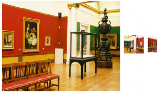
Enigma Listening Group whose invaluable contributions enabled the project, and the mystery of the 'unheard' second code in the eponymous orchestral variations by English romanticist Edward Elgar—is an audio installation in the main hall of Bury City Museum's painting collection. Formally reduced to a sound signal and set amongst this Edwardian interior

The image to the left is representative of the Bury City Museum where they are running an art exhibition.