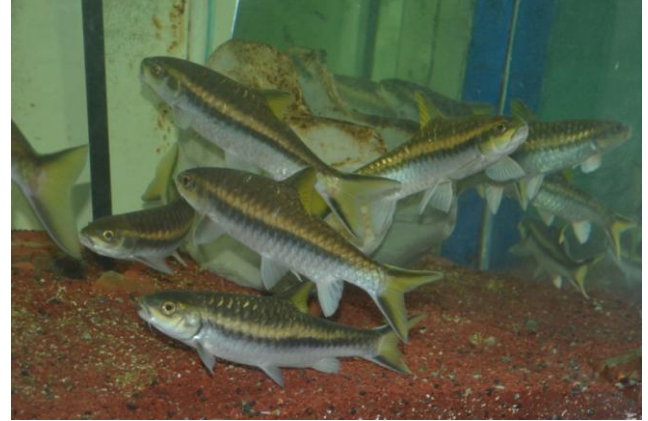
Chocolate mahseer brood stock