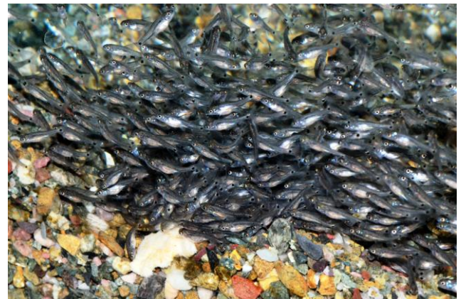
Chocolate mahseer fry in tank