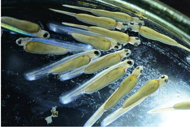
Chocolate mahseer hatchlings