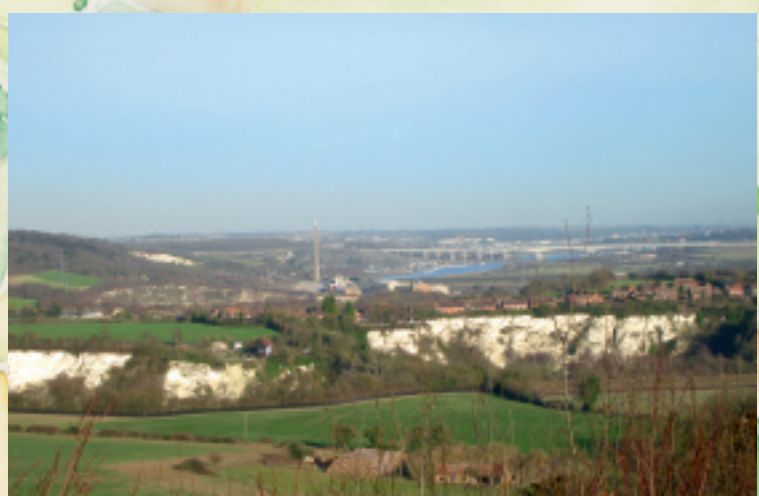
Disused quarries are a characteristic feature of the Medway Gap; a reminder of the once thriving industrial past that this area was so important for