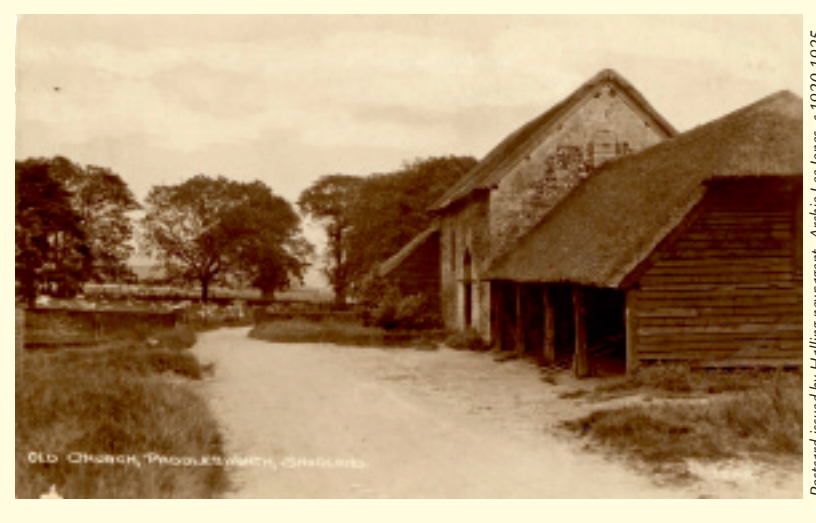
Some of the buildings at Paddlesworth date back to the 13th century while the stunning church dates back to Norman times.

When you reach Paddlesworth Road , turn right and then immediately left along the footpath that runs alongside the group of buildings and up the hill towards the North Downs. Take care here as you will be on a road with no pavement for 50m.