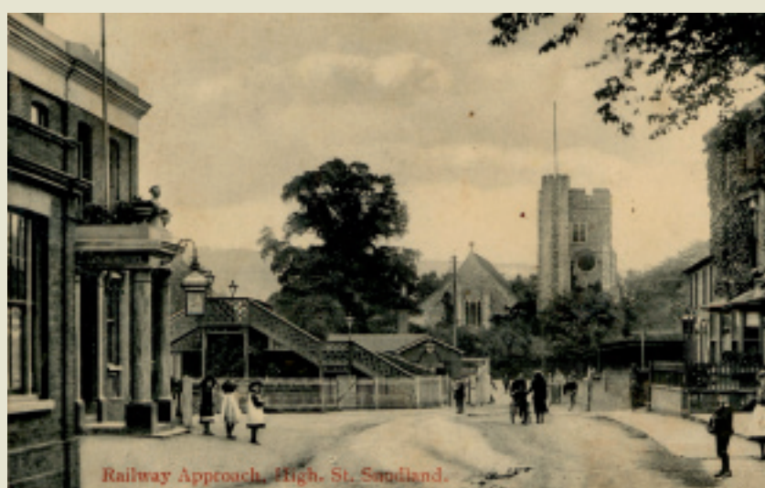
Railway Approach, High St, Snodland

The parish church of All Saints is one of many locally which are sited near the river and offers a contrast to the industrial site next door. Little remains of the church's earliest fabric, although it was mentioned in the Domesday Book, and today what can be seen is largely 13th to 15th centuries. Note that there is a large cross by the gate which was erected by the rector in 1846. The other building in this area was the ferryman's house which was built by the rector in the 1840s behind the church. Although the ferry no longer exists, it operated until 1948 and was at its busiest when the cement works were active on both sides of the river.