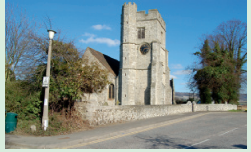
All Saints Church is mentioned as far back as the Domesday book of 1086 with the present building largely work from 13th - 15th century.

Turn right into Mill Street and over the railway line. Follow the road as it bears left into Brook Street . At this point you can take a short cut by turning right over the bridge over the main road into Rocfort Road and heading back to the car park or follow part of the heritage trail. Continue along Brook Street and keep to the left. Go past East Street and then take the next left. Do not go towards the roundabout. You will pass a series of industrial buildings and come to a car park with a track on the right before the entrance to the car park. Take this track keeping the waterway on your right. This is the entrance to Leybourne Lakes .