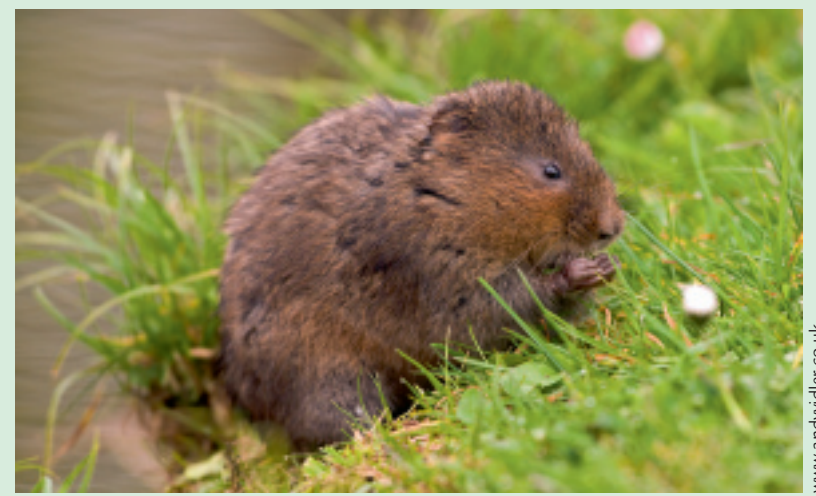
Listen out for the characteristic 'plop' of the water vole as it dives head first into the water. Water voles are the most dramatically declining of all British mammals but they do live at Leybourne Lakes so keep your eyes and ears peeled.

Follow this path for about a kilometre keeping the stream to your right. Brooklands Lakes will lie to your left the far side of the railway line. At the end of the path turn left and then right almost straight away keeping the main lake ( Ocean Lake ) on your left hand side. Follow this path all the way around the lake keeping the lake to your left. After passing through some housing and going across a tree-lined causeway between two lakes you will eventually come back to the point where you first approached the lake.