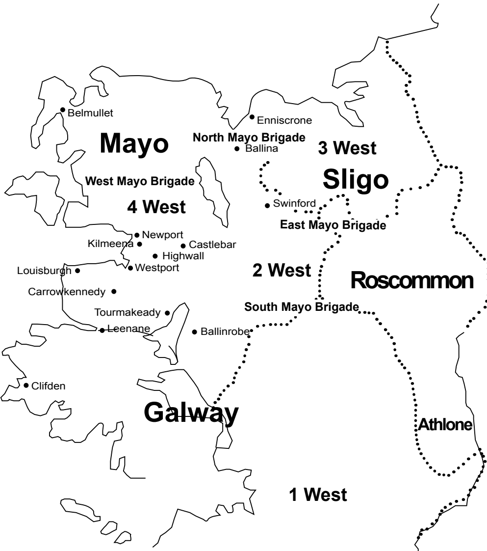
Map showing counties, brigade areas and areas of the four Western Divisions.

O'Malley was suspicious of a compromise being made during the peace negotiations which resulted in the Anglo-Irish Treaty of December 1921 and reacted strongly against the Treaty when it was announced. As the split developed in the senior ranks of the IRA in early 1922, he was appointed director of organisation for the anti-Treaty Republicans who then took over the Four Courts in April. When the Four Courts garrison surrendered in June, he managed to escape. He was then appointed acting assistant chief of staff and officer commanding the Northern and Eastern Divisions, or half of Ireland. In early November he was captured in a dramatic shoot-out and was severely wounded. Ironically his wounds probably saved his life, as otherwise he would have been court-martialled and executed. While in Mountjoy Gaol in