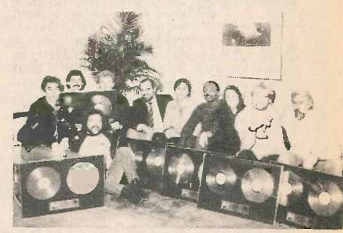
A&M group present gold and platinum to Payola$ for Hammer On A Drum, during their recent tour, opening for Duran Duran.