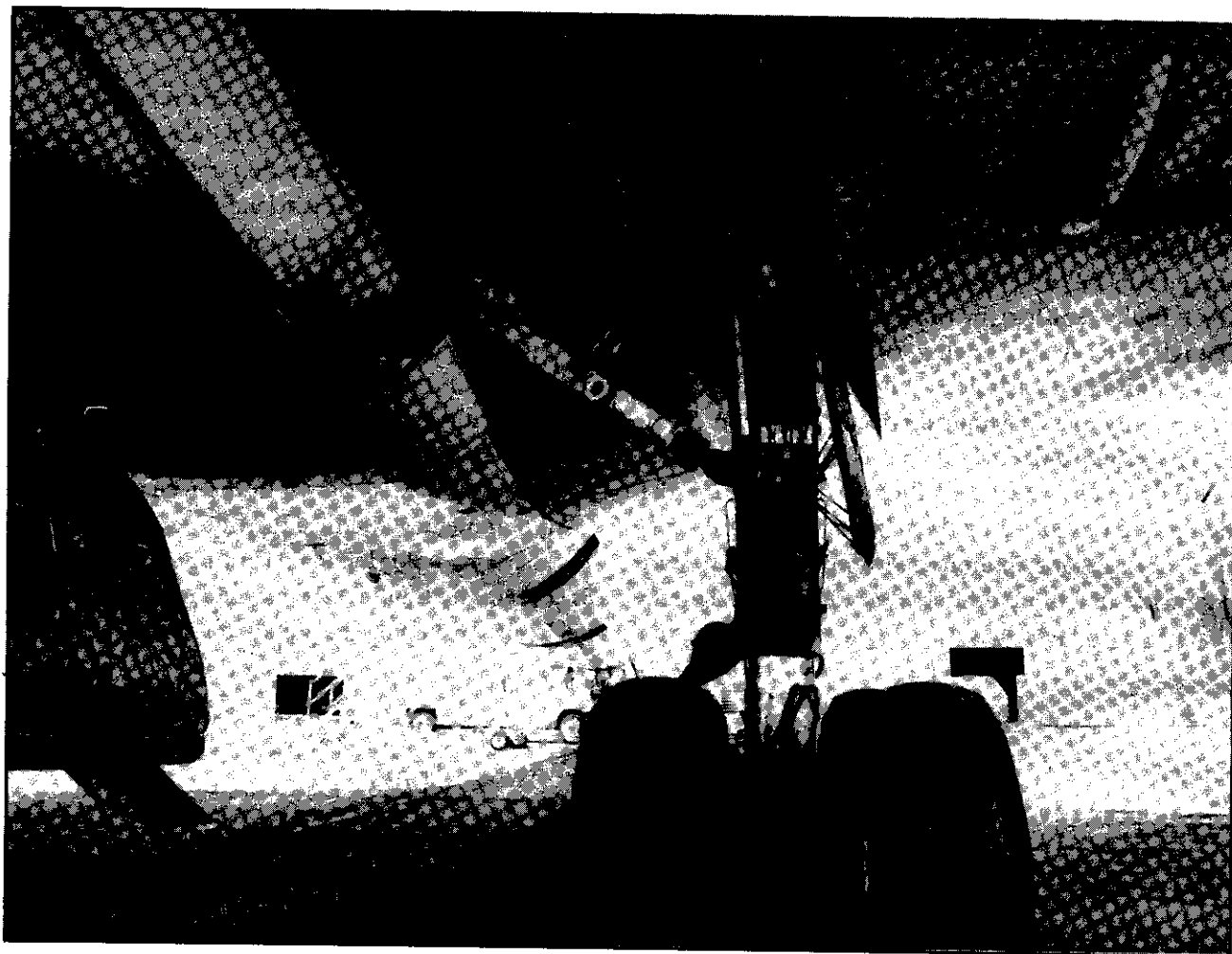
Figure 1. Wheel-Well Passenger Stow-Away Space. it is forward of DC-8 Right Main Landing Gear, Wing Root Area.

When the landing gear retracts in jet aircraft, metal covers close over the opening where the wheel and strut are positioned when the gear is extended, thus reducing in-flight air drag and further securing a stowaway.