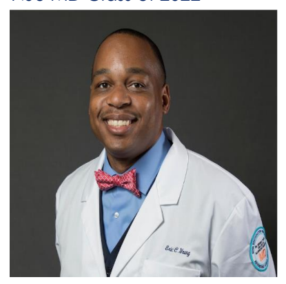
What Makes Me Unique: I am a construction of diversity, built by bricks of emotional intelligence and compassion.

My definition of diversity: the beauty of inclusion and representation of individuals of varying demographics" in an effort to promote cultural competence.