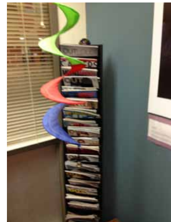
Figure 2. Photo of several "Out" magazines inside GMU's LGBTQ Resource Center