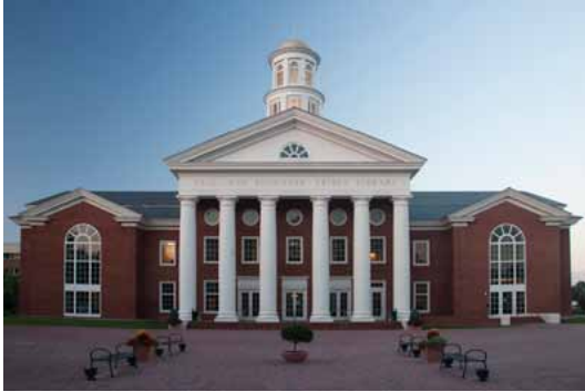
Figure 11. CNU's Paul and Rosemary Tribble Library