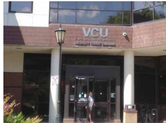
Figure 8. University Student Commons, which houses VCU's Office of Multicultural Student Affairs and Safe Zone