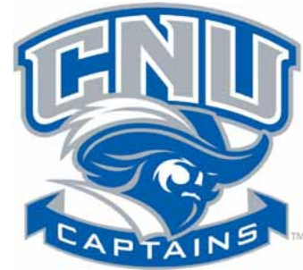
Figure 12. CNU's Athletic Logo