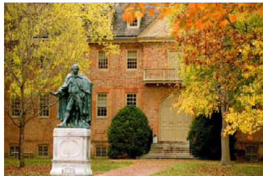
Figure 2. A photo from the College of William and Mary, located in historic Williamsburg, VA