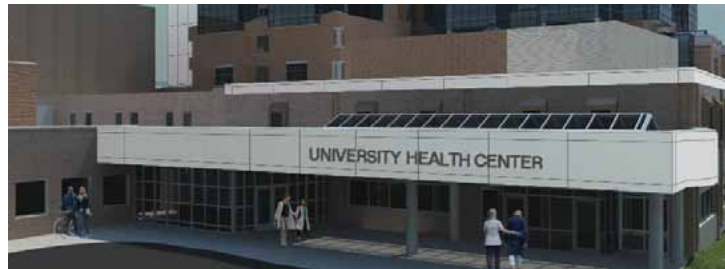
Figure 4. JMU's University Health Center, which houses the LGBTQ Resource Center