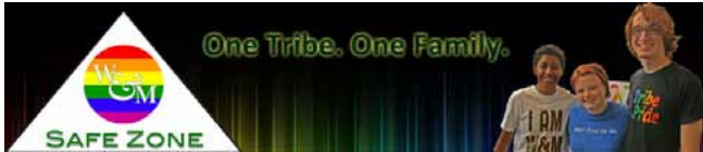
Figure 13. A photo from W&M’s Safe Zone Ally webpage, which provides a number of resources and referrals for LGBTQ students