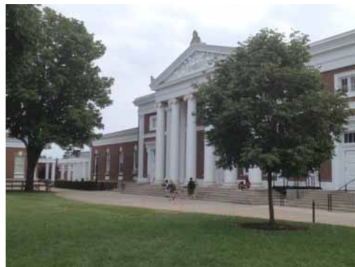
Figure 6. A photo of the rotunda near UVA's LGBTQ Resource Center