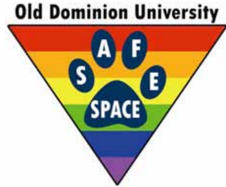
Figure 9. A Safe Space sign from ODU’s website