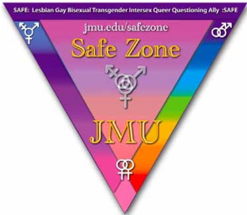
Figure 3. A photo from JMU's Safe Zone program from the university website