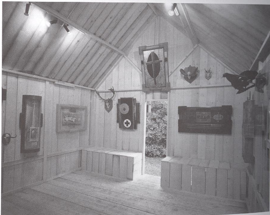
IRWIN. Geography of Time . 1992. Mixed media. Installation view from the exhibition Molteplici culture in Convento di S. Egidio , Rome, 1992.

The art of Nazi Germany was essentially the same. In both cases there was talk of creating an art without viewer or consumer — assuming one did not include in this definition Hitler and Stalin, who simultaneously appeared as its true creators: the populations of both empires appeared themselves within the art as its material. Here the traditional forms of art were utilized as tools for the most radical critique of the traditional conditions of life — all the way to their radical elimination. This is the source of the ecstatic and psychedelic character of Stalinist and Hitlerist art, which are more reminiscent of the contemporary phenomena of Surrealism or magic realism than the sober mimetic realism of the past.