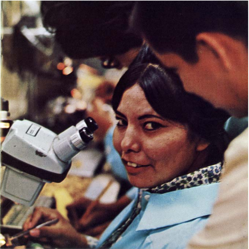
Figure 3. Shiprock Dedication Commemorative Brochure , September 6, [1969], lot X5184.2009, folder 102725169, Computer History Museum, Moun- tain View, CA.

merely a different material iteration of the same pattern or aesthetic tradition found within the integrated circuit. The opposing page states, “The blending of innate Navajo skill and Semiconductor’s precision assembly techniques has made the Shiprock plant one of Fairchild’s best facilities—not just in terms of production but in quality as well.”