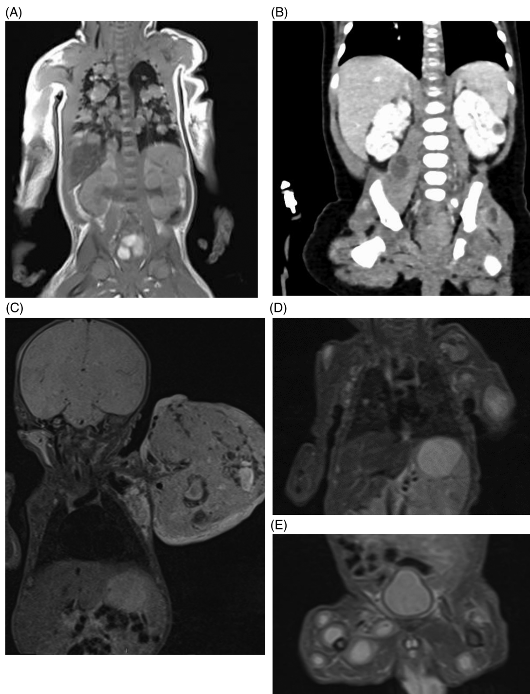
FIGURE 1 MRI images demonstrating extent of disease in each case. (A) Extensive pulmonary disease in case 1, abdominal disease not appreciable by MRI. (B) Renal, retroperitoneal nodal, and intramuscular disease deposits in case 2, following surgical resection of ovarian disease. (C) Large unifocal myofibroma in case 3. (D and E) Extensive subcutaneous disease with pulmonary and liver nodules in case 4

neonates with drugs whose pharmacokinetics are not well established. Infant physiology changes significantly during the first weeks of life, with marked variability in drug exposure previously reported in neonates treated with several chemotherapeutics. 13–16 It is likely that variability in vinblastine pharmacokinetics observed in adults is amplified in infants due to these physiological changes. While limited published data exist concerning the metabolism of vinblastine in patients,