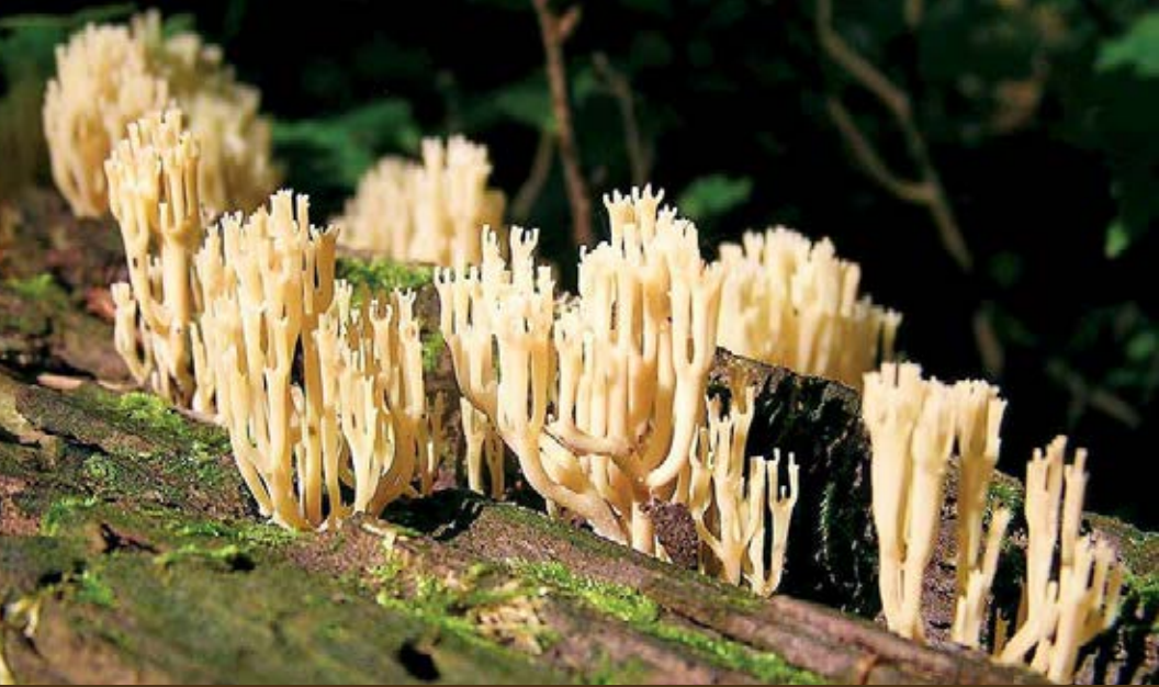
Crown-tipped coral Artomyces pyxidatus