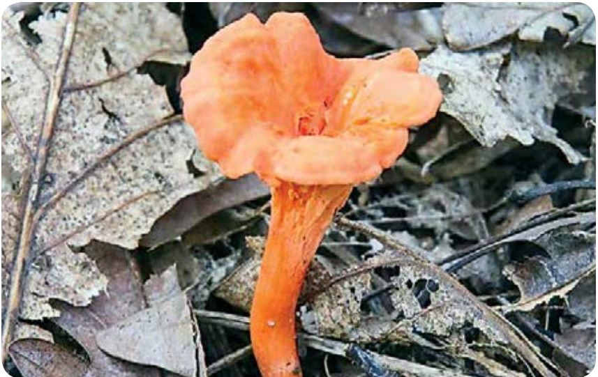
CHRIS EVANS, ILLINOIS WILDLIFE ACTION PLAN, BUGWOOD.ORG