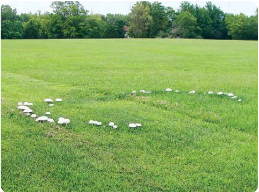
LISA K SUITS

Habit: They can grow as single individuals or often appear in a fairy ring.