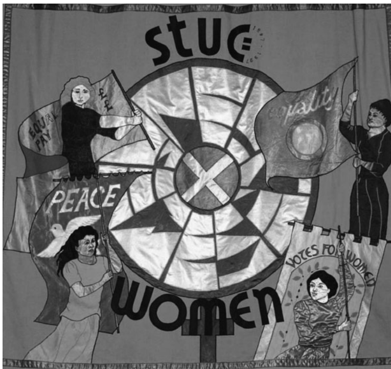
Trade union women – making our voice heard on International Women's Day