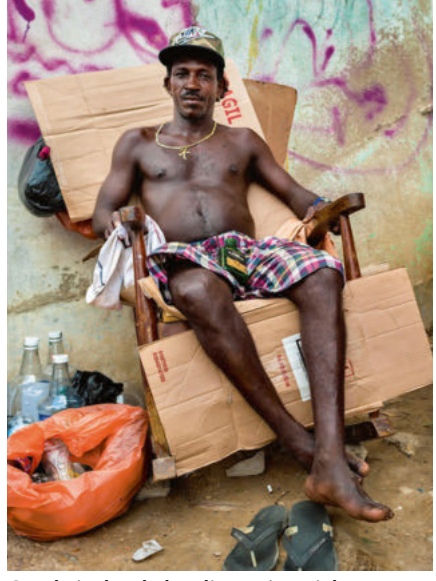
Candy is dandy but liquor is quicker