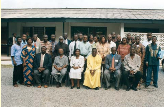
Ghana Chapter Roundtable Conference participants

"It is no longer debatable that the world today moves on science and technology," acknowledged the Honourable Minister for Environment and Science, Ghana, Prof Kasim Kasanga.