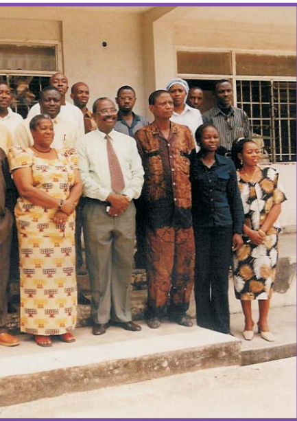
in Lagos, Nigeria