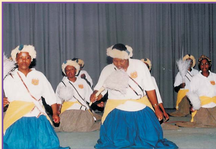
Basotho women cultural dance group (Sholchibo) performing during the closing of 2003 ATPS Workshop, Lesotho