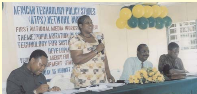
Official opening of ATPS Workshop on "S&T Popularization and the Media" in Nigeria

The press in Nigeria can potentially play an important role in disseminating scientific research results but this role remains largely unfulfilled among the nation's newspapers due to lack of skilled science and Technology journalists.