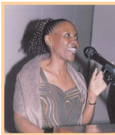
"Welcome to Lesotho", says Hon Dr 'Mamphono Khaketla, Minister for Communication, Science and Technology

Speaking during the opening ceremony, the Minister for Communication, Science and Technology, Honourable Dr 'Mamphono Khaketla, lauded the choice of the theme, Science and Technology and Food Security in Africa, saying that it was not only timely but also relevant, considering the current economic predicament that Africa is facing. Bringing the issue closer home, Minister