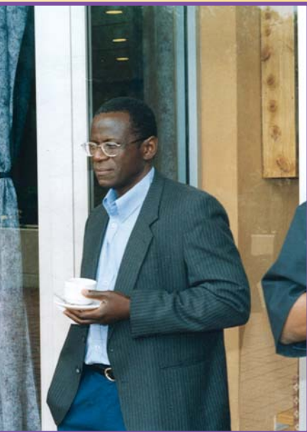
with fellow workshop participants during a regional workshop,