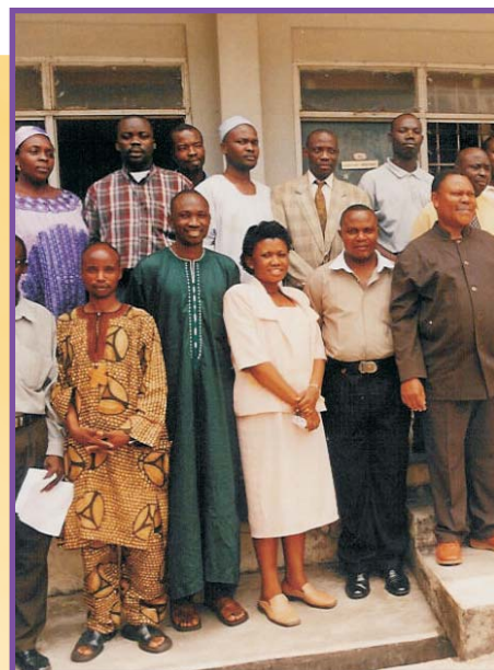
Participants at the First National Media Workshop/Luncheon held