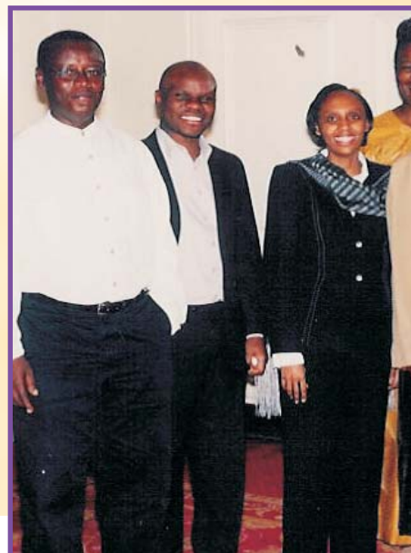
ATPS Secretariat staff during a social function