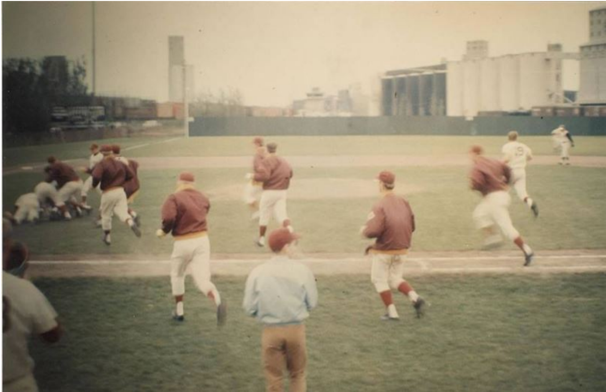
Gophers celebrate after sweeping Michigan State for the Big Ten title