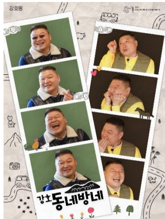
Far and Wide with Kang Ho-dong