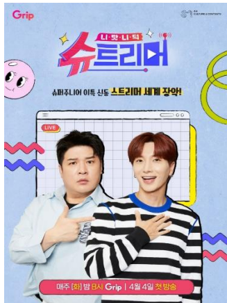
Your Fault Your Favor Sutreamer