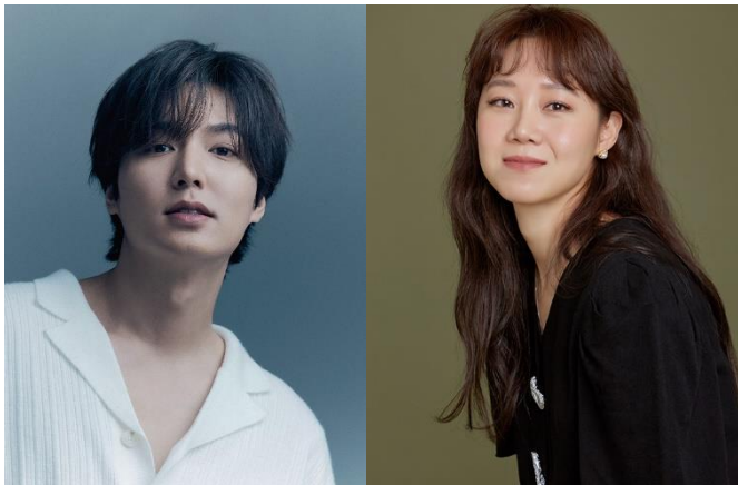
'When the Stars Gossip' Main characters, Minho Lee and Hyojin Kong