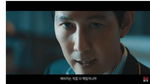
K Car 'K-Class'