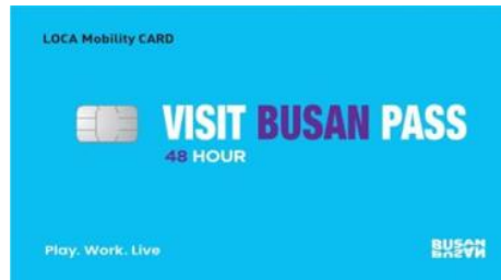
VISIT BUSAN PASS