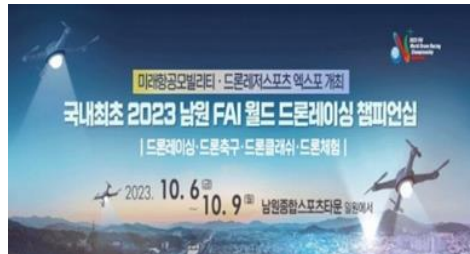
The 2023 FAI World Drone Racing Championship in Namwon