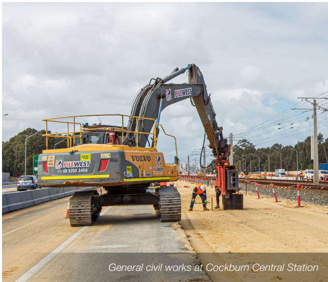
General civil works at Cockburn Central Station