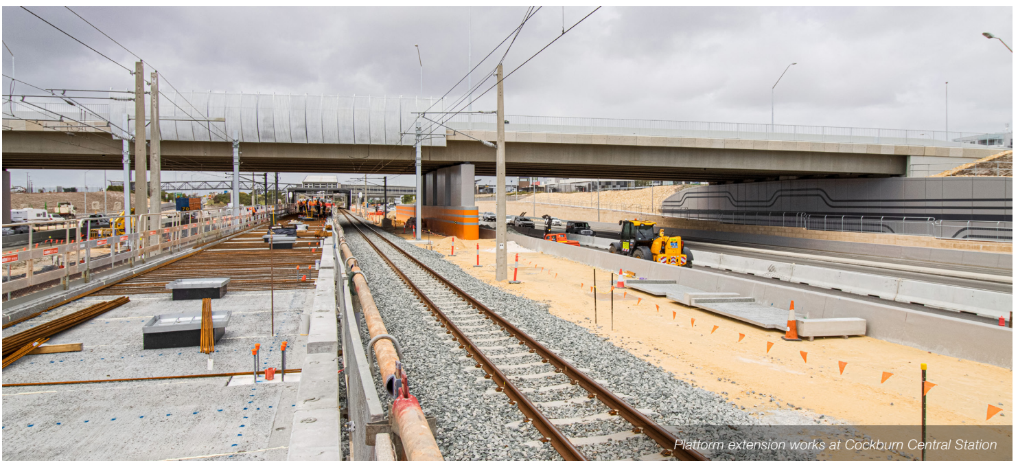
Platform extension works at Cockburn Central Station

Due to the location of the works, trains cannot operate safely past Aubin Grove Station during the planned shutdown, which means trains between Aubin Grove and Elizabeth Quay stations will be replaced by bus services.