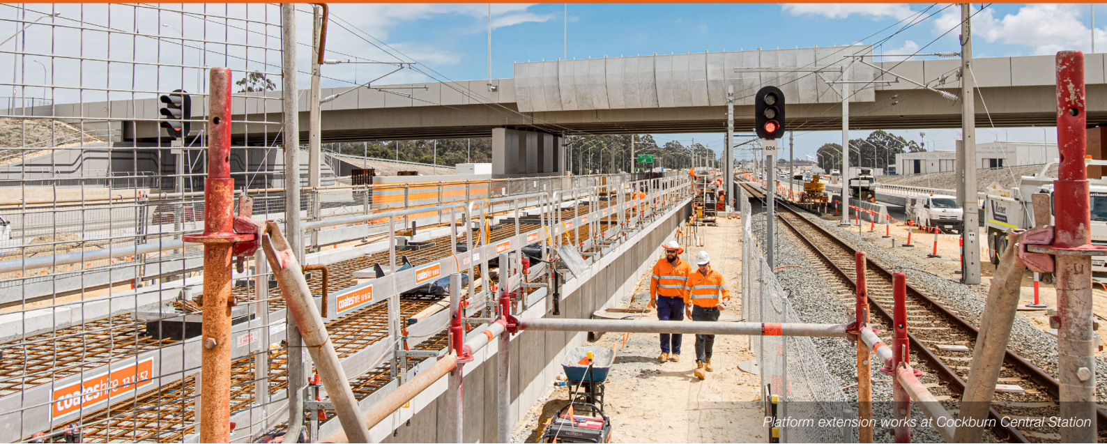
Platform extension works at Cockburn Central Station

Is this the only impact to the Mandurah Line required to build the Thornlie-Cockburn Link?