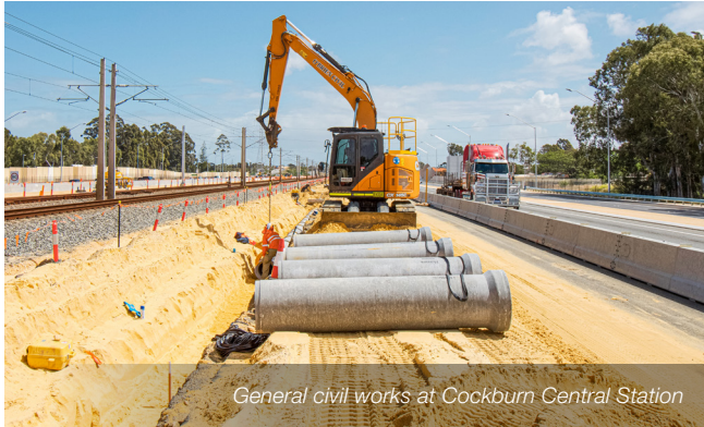
General civil works at Cockburn Central Station

Construction impacts may include noise, dust, vibration, increased light from temporary lighting and more heavy vehicles on local roads near site access points.