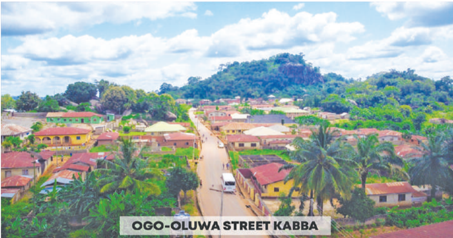
OGO-OLUWA STREET KABBA