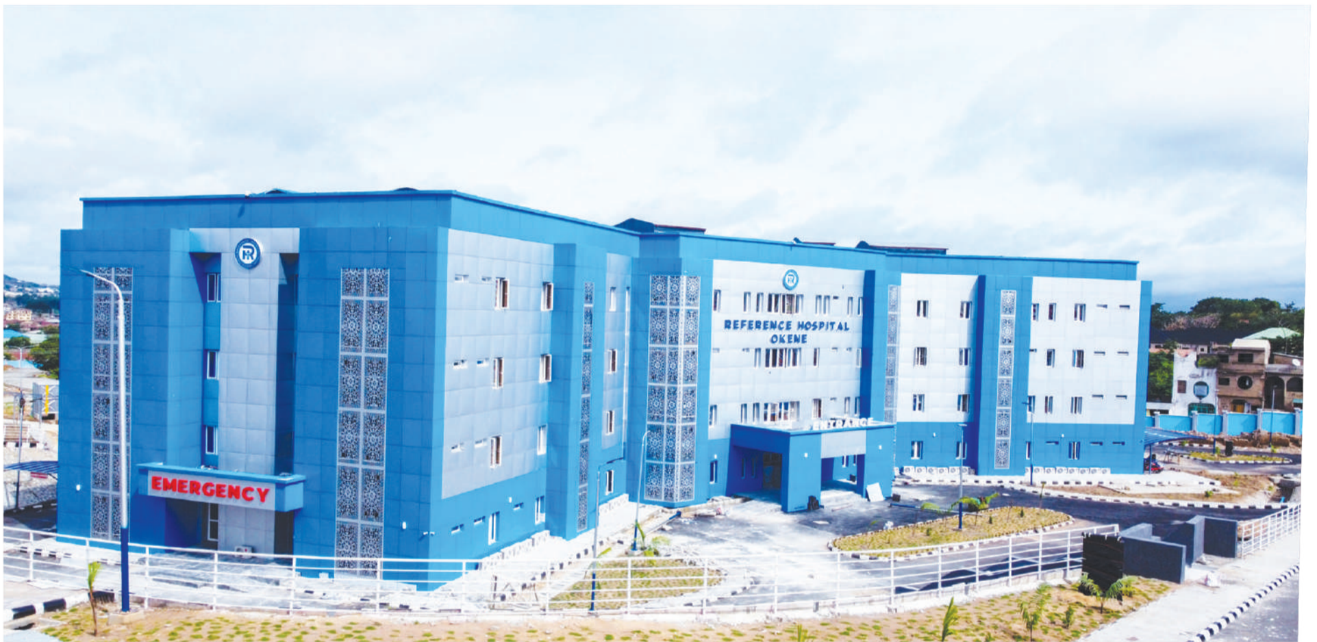
WELL EQUIPPED 300 BED REFERENCE HOSPITAL, OKENE KOGI STATE