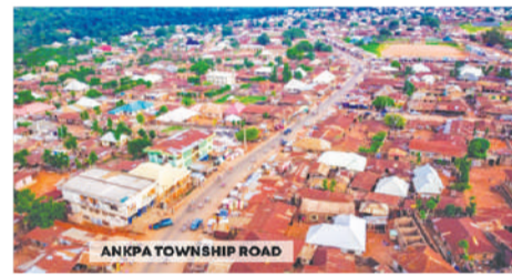
ANKPA TOWNSHIP ROAD