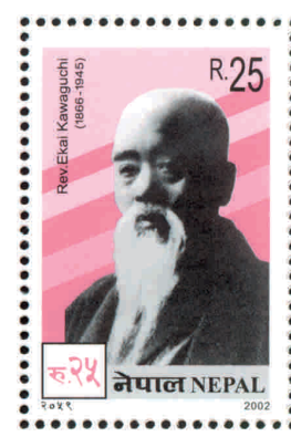
Postal stamp of Rev. Kawaguchi issued in December 2002