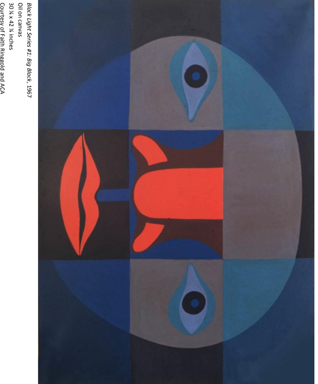
Photo: Jim Frank © Faith Ringgold 1967 Galleries, New York Courtesy of Faith Ringgold and ACA