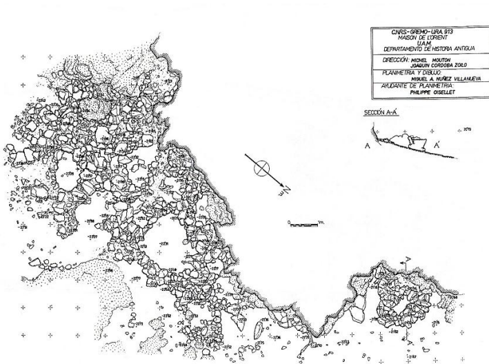
Figure 2. Al-Madam 32. Offering area located on a small rocky platform at the base of the central promontory of Jebel Buhais. Drawing by M.A. Nuñez, Spanish Archaeological Team.

Nevertheless at the foot of the promontory where the stone building stands, the French-Spanish team found a concentration of nine small tombs that can now be identified as an offering area. They were located on a small rocky platform at the base of the promontory. Almost all of these “graves” had been looted but the pottery, the beads, the softstone fragments and the arrowheads that were found pointed to the Iron Age for this remarkable discovery (del Cerro 2010:41–45) (Figure 2).