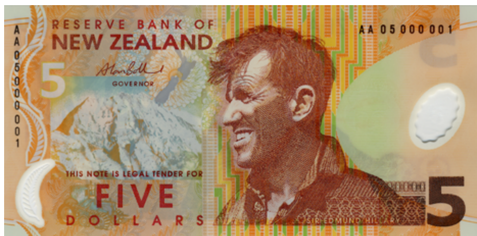
Above: Series Six $5 polymer note obverse, featuring Sir Edmund Hillary, showing the slight alterations to the Series Five design required to introduce new security features.

the question was whether the public had any mood to change the existing selection.