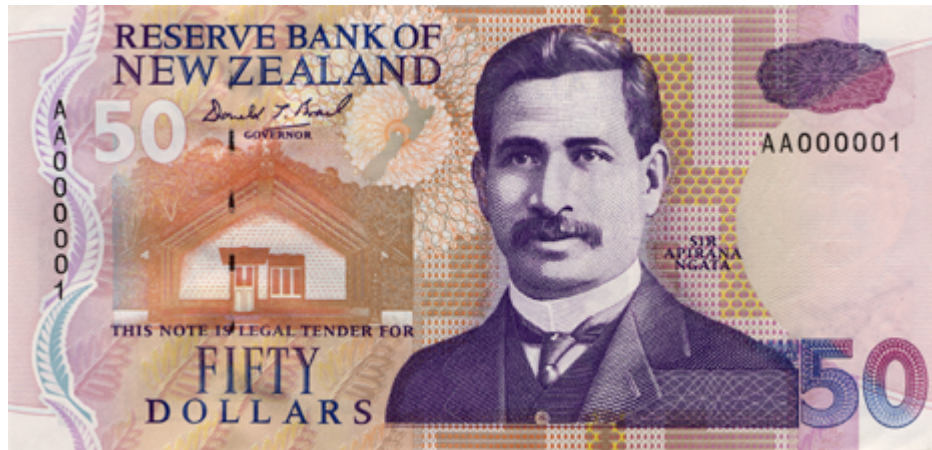
Above: Series Five $50 note obverse, featuring Sir Apirana Ngata.