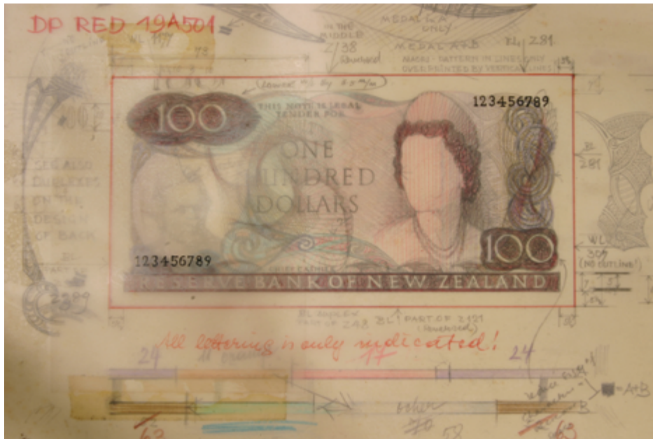
Above: Draft sketch for the obverse of the Series 3 $100 note.