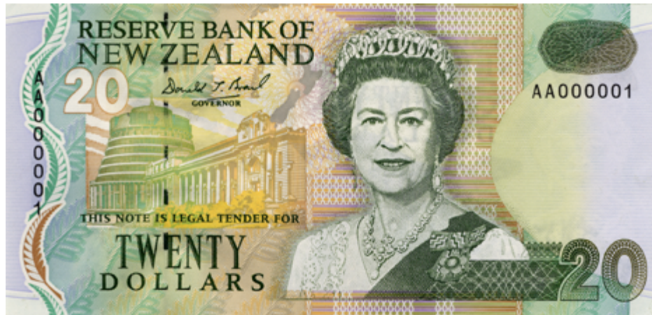
Above: Series Five $20 note obverse, featuring Her Majesty Queen Elizabeth II.

notes, making way for four New Zealand figures. This was in line with international trend: indeed, Australia had put the monarch on just one denomination when they decimalised in 1966; and the British had been featuring prominent individuals, ranging from Charles Dickens to George Stephenson and Sir Christopher Wren, since their own decimalisation in 1970. 44 New Zealand – which had added the Queen only in 1967 – was something of an outlier by these standards.