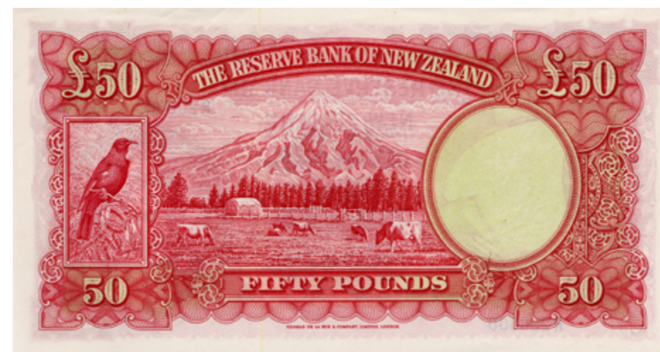
Above: the Series 2 fifty pound note of 1940, again with iconography redolent of New Zealand's mid-20th century self-image of the day as a child of Britain - and Britain's farm, underscored by the dairying images with Mount Taranaki (Egmont) on the reverse.