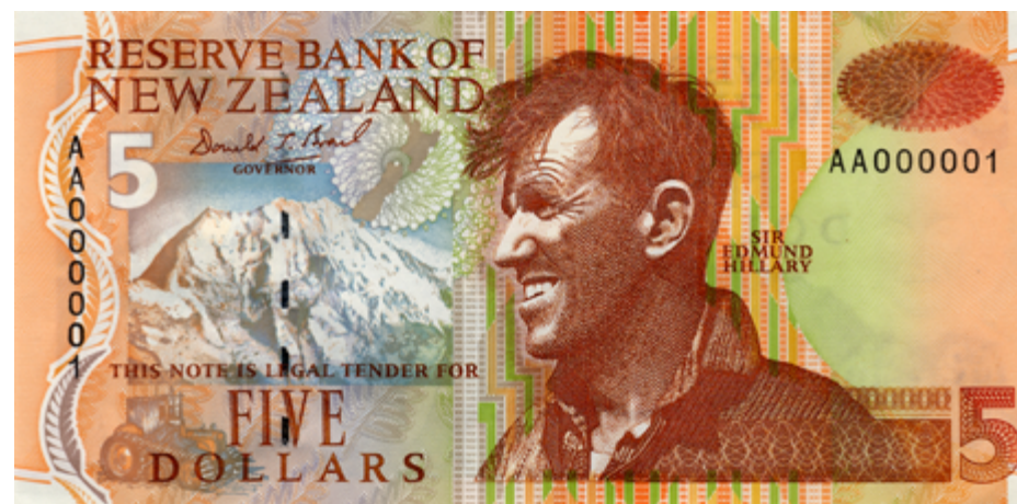
Above: Series Five $5 note obverse, featuring Sir Edmund Hillary.