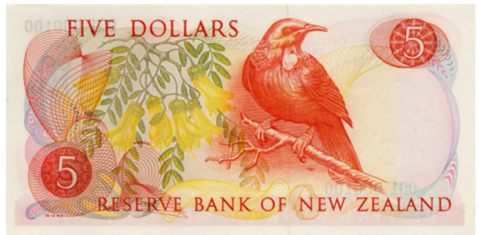
Above: Reverse of the Series 3 $5 note, showing the tui and kowhai flowers.