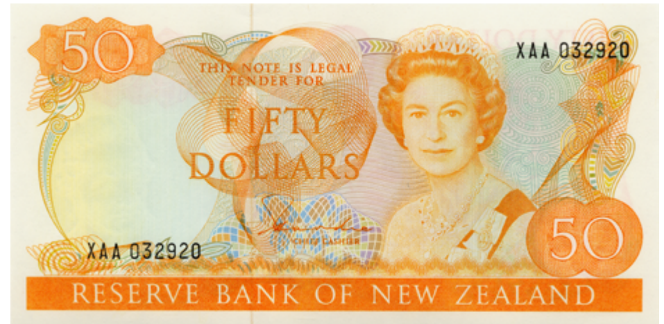
Above: Obverse of the Series 4 $50 note, a new denomination introduced in 1984, showing the updated portrait of Her Majesty Queen Elizabeth II, which featured on all denominations of that series.

The exact ‘New Zealand’ aspect of the mix was subject to a good deal of debate: the Design Committee considered a range of possible themes, from historical moments to scenery. In the end they settled for birds and the plants most closely associated with them, including the piwakawaka (fantail), titipounamu (rifleman) and tui, each with a plant closely