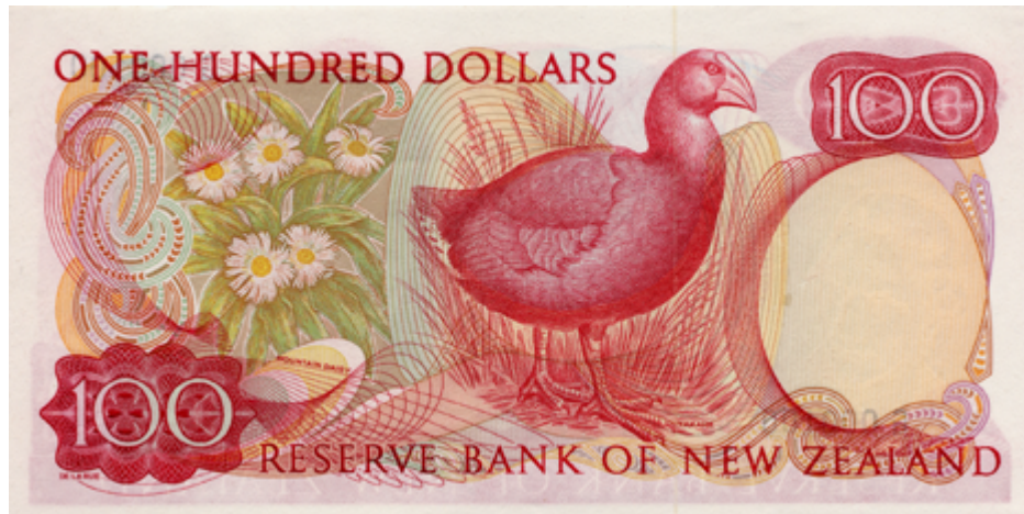
Above: Reverse of the Series 3 $100 note, featuring the endangered Takahe, a bird thought extinct but re-discovered in the late 1940s.

Despite an intention to start with a blank sheet, what emerged – once again – had to engage with prevailing sensibilities, and was framed by New Zealand’s dual concept of its national identity. The designs featured New Zealand themes and motifs on one side and a specific symbol of Pakeha New Zealand’s identification with its colonial origins on the others: Her Majesty, Queen Elizabeth II. She featured on all the notes. Cook was removed to the watermark. This stood in contrast with the Australian decimal notes, where the Queen featured on but one denomination. New Zealand’s prevailing social concept of itself – as reflected in these themes – was clearly defined by more than the broadening of trade on the back of the Korean war wool boom.