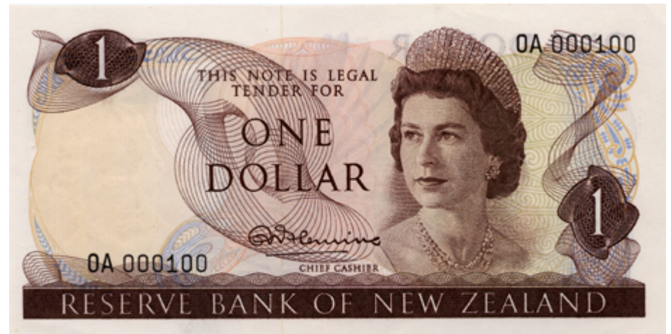
Top: Obverse of the Series 3 $1 note.