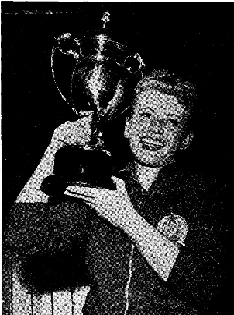
The smiling champion. Gizi Farkas holds her trophy aloft.