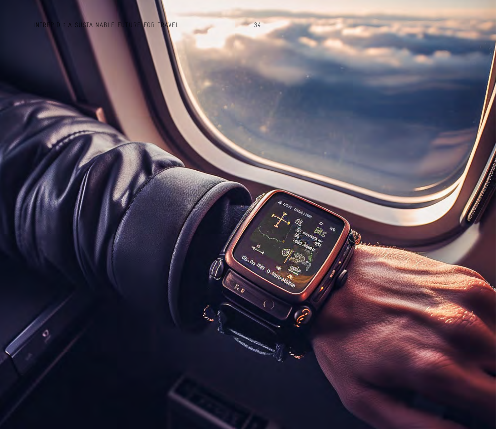
Real-time Footprints, AI imagery by Intrepid Travel