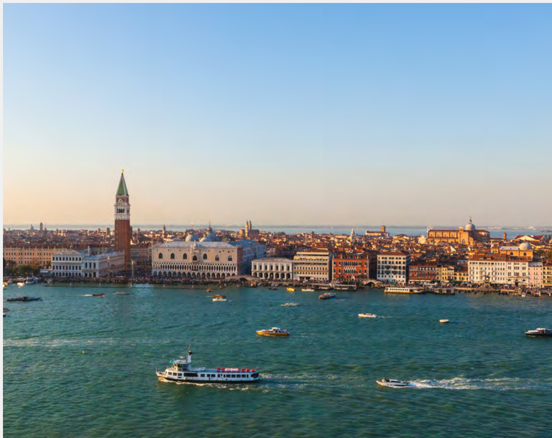
Venice