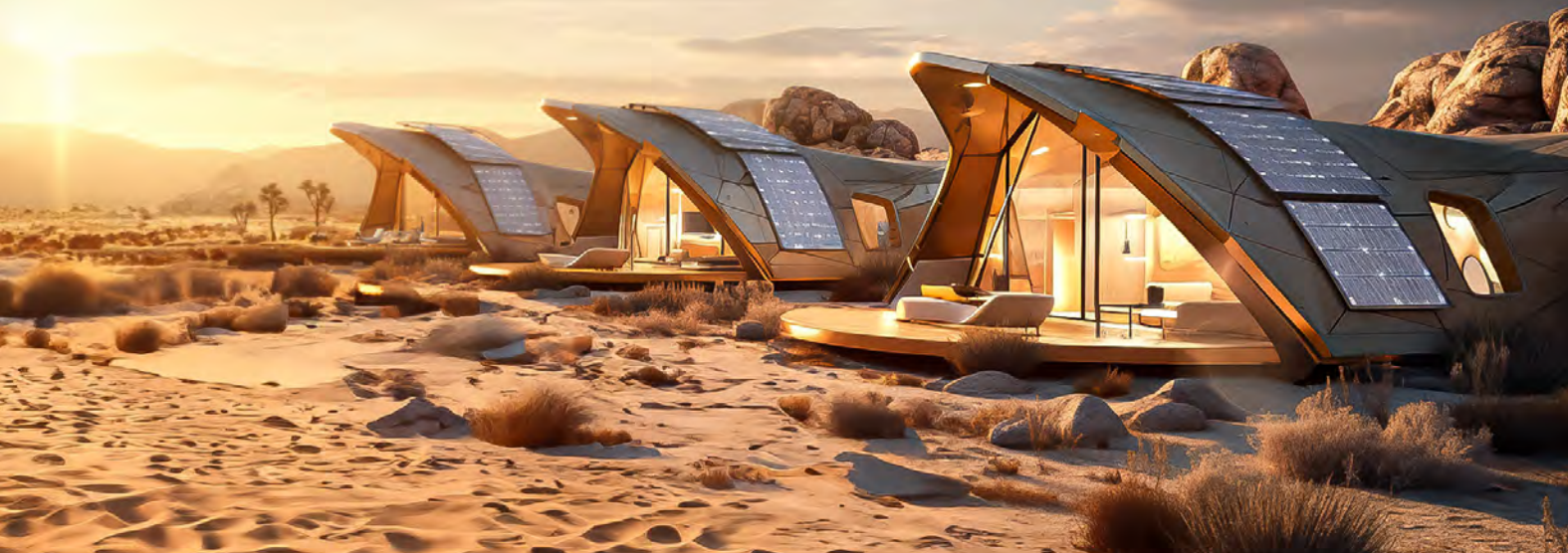
Ephemeral Escapes, AI imagery by Intrepid Travel