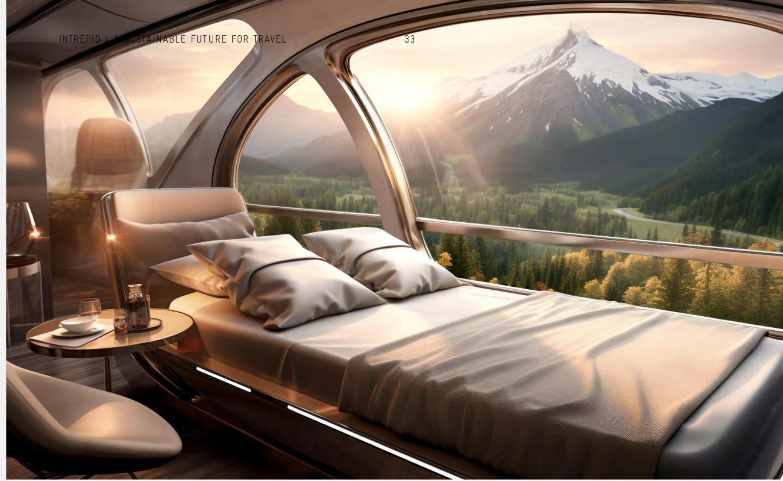
Enhanced Eco-mobility