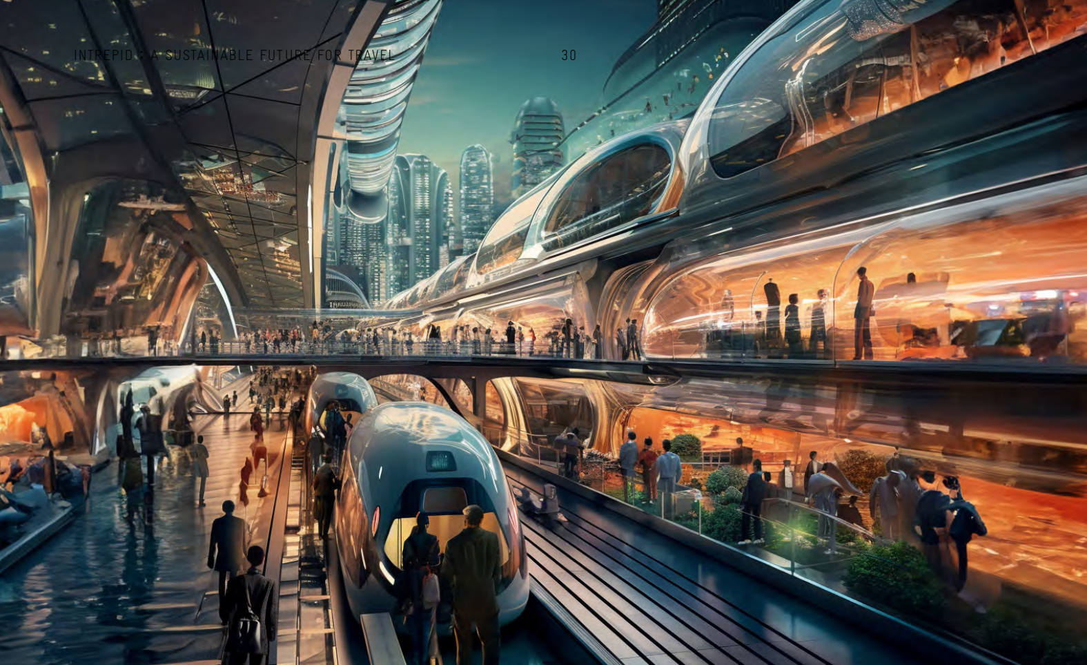
Enhanced Eco-mobility, AI imagery by Intrepid Travel