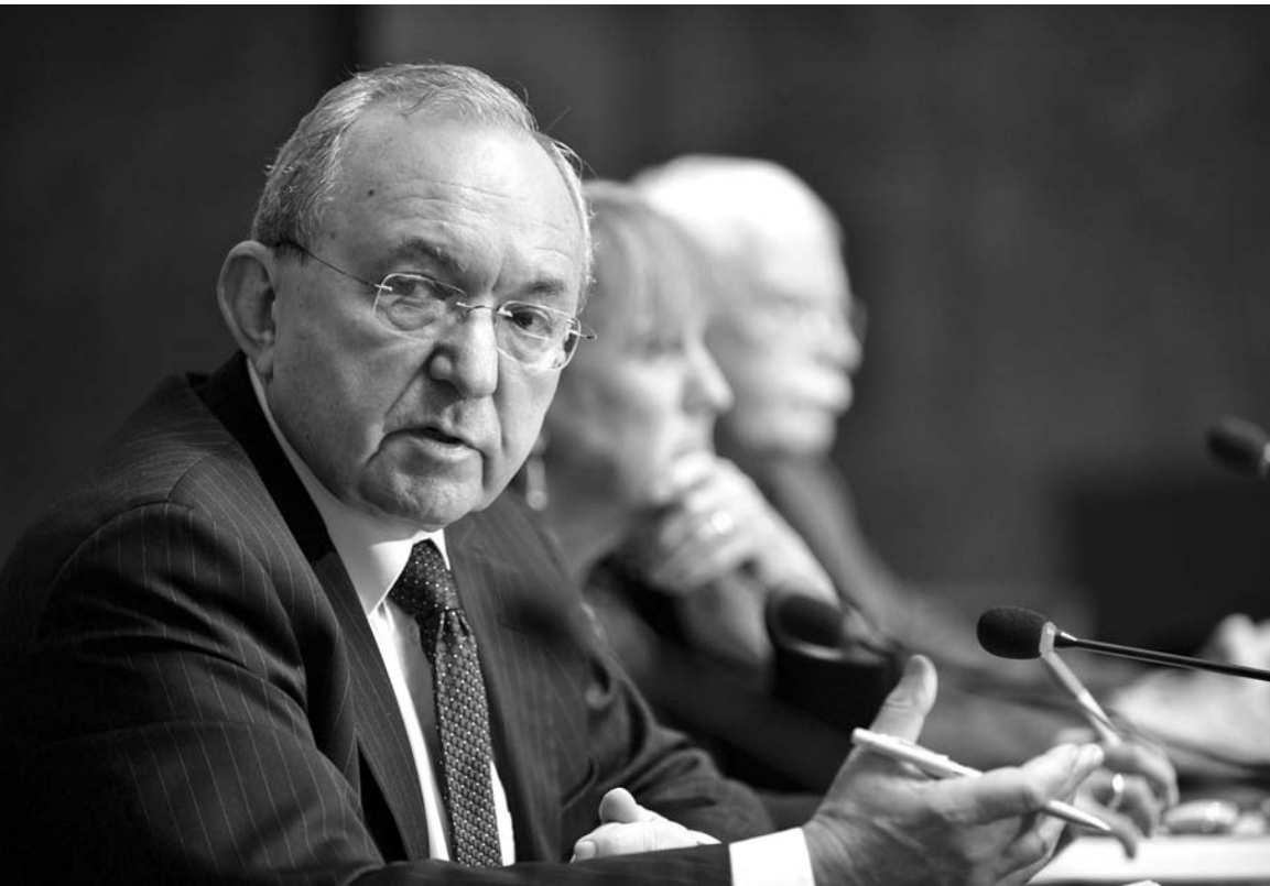
FIGURE 2. Richard Goldstone.