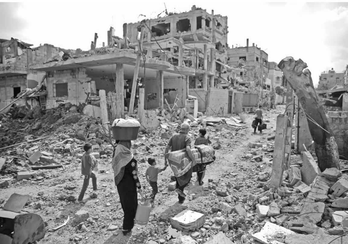
FIGURE 4. Gaza, August 2014.