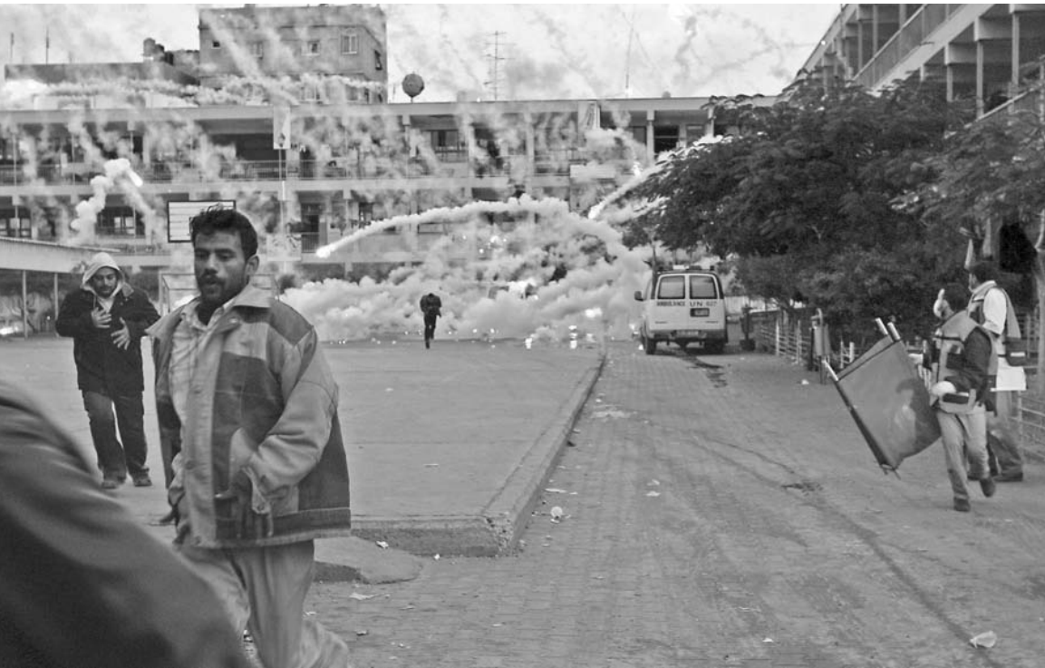
FIGURE 1. White phosphorus attack.