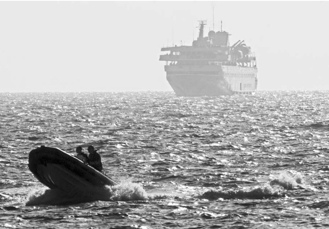
FIGURE 3. Mavi Marmara (on right).